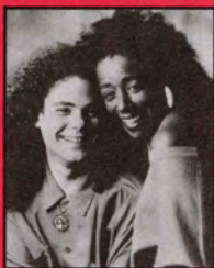
Tuck & Patti

Enjoy the delicious blend of southern hospitality, regional foods and superstar entertainment, October 11 - 13, at one of America's largest and most exciting free jazz festivals.