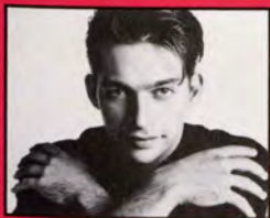
Harry Connick, Jr.

Also enjoy a sneak preview performance by Metronom , an ensemble group from Murmansk, Russia.