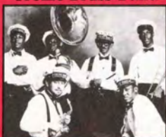
Treme Brass Band