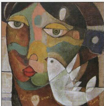
ART BY HUONG

Conflict Transformation Symposium: lectures, panels, festival on the Green, performing art presentations, and Peace Mural interactive exhibition by Houg. For more information, visit