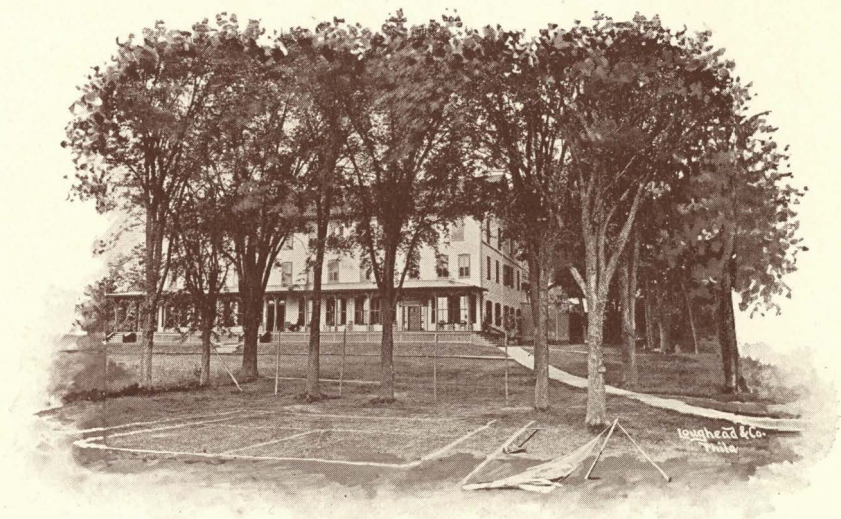
Franklin House, Highgate Springs, Vt.