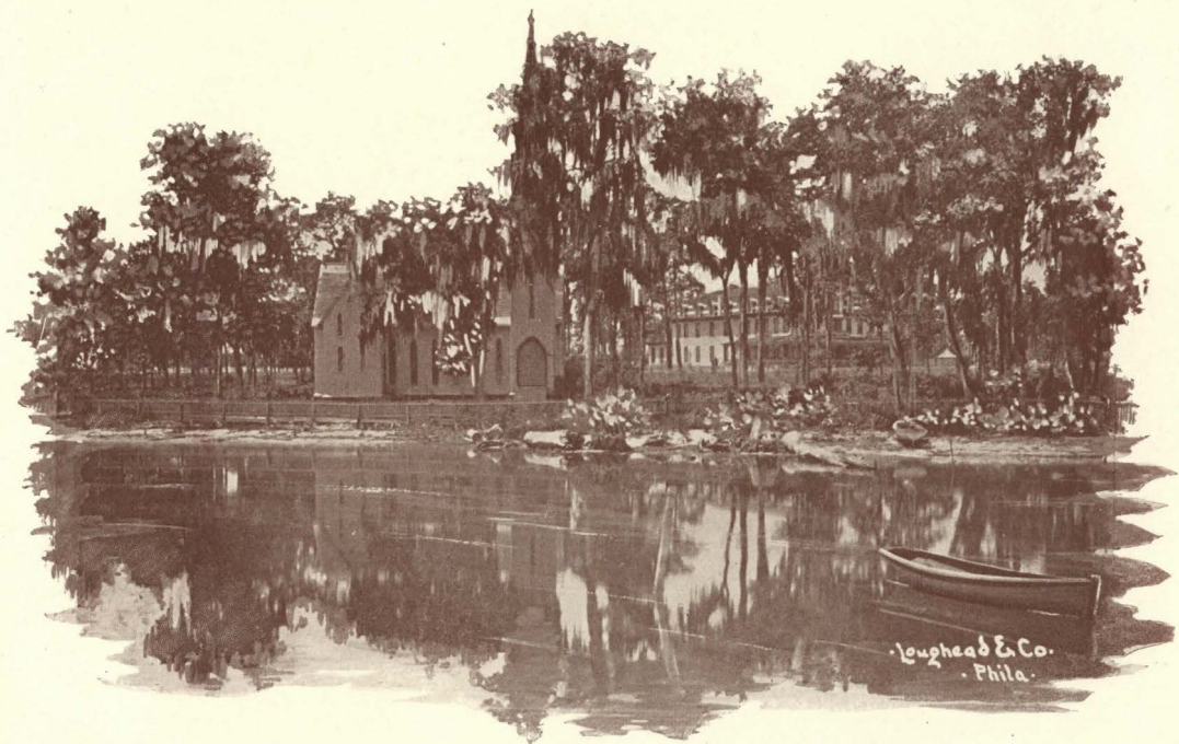
Looking toward Hotel St. Elmo from St. John's River.