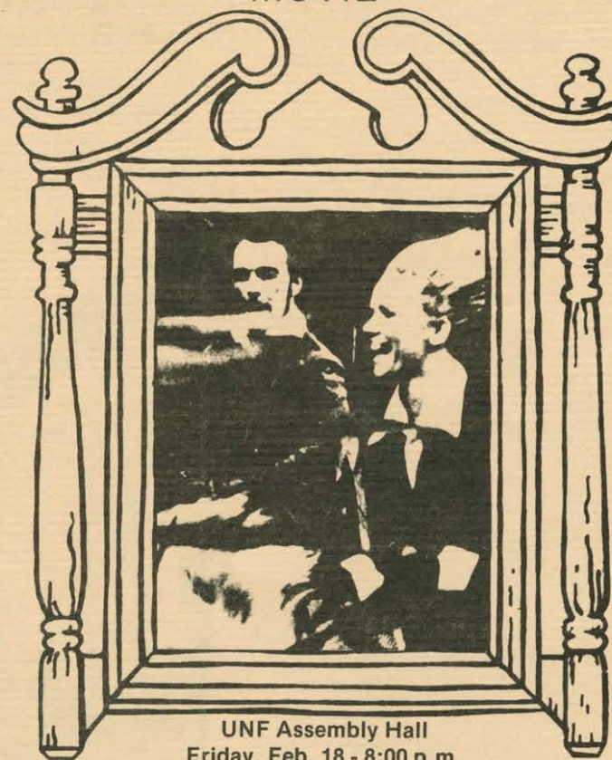
UNF Assembly Hall Friday, Feb. 18 - 8:00 p.m.