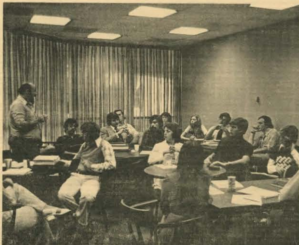
Meeting of ICAC

'Once upon a time' there existed at UNF a time slot on the course schedule booklet which was designated as an activity period. During this time - 11:50 a.m. to 1:20 p.m. - students (and faculty) could take a lunch or study break or - anyone who belonged to a campus club or other organization was free to join in the activities which the organization sponsored. As a result, UNF organizations became strong with many members actively participating. And - both students and faculty were better prepared for evening classes with mental faculties refreshed by the break.