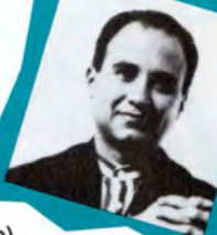
Nnenna Freelon (top), Michel Camilo (bottom)