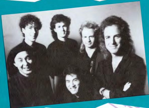
The Rippingtons featuring Russ Freeman

The free-flowing sounds of jazz wash over Florida's River City for four days of contemporary and straight-ahead jazz. One of America's largest free festivals, the Jacksonville Jazz Festival , presented by Diet Coke and produced by WJCT, promises good times, good food and great jazz by jazz greats.