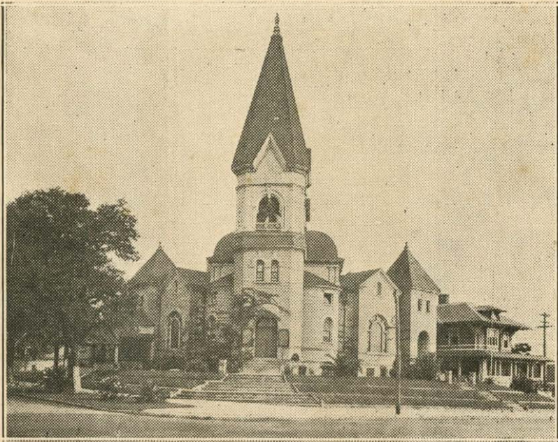
BETHEL BAPTIST INSTITUTIONAL CHURCH Corner of Hogan and Caroline Streets JACKSONVILLE, FLORIDA