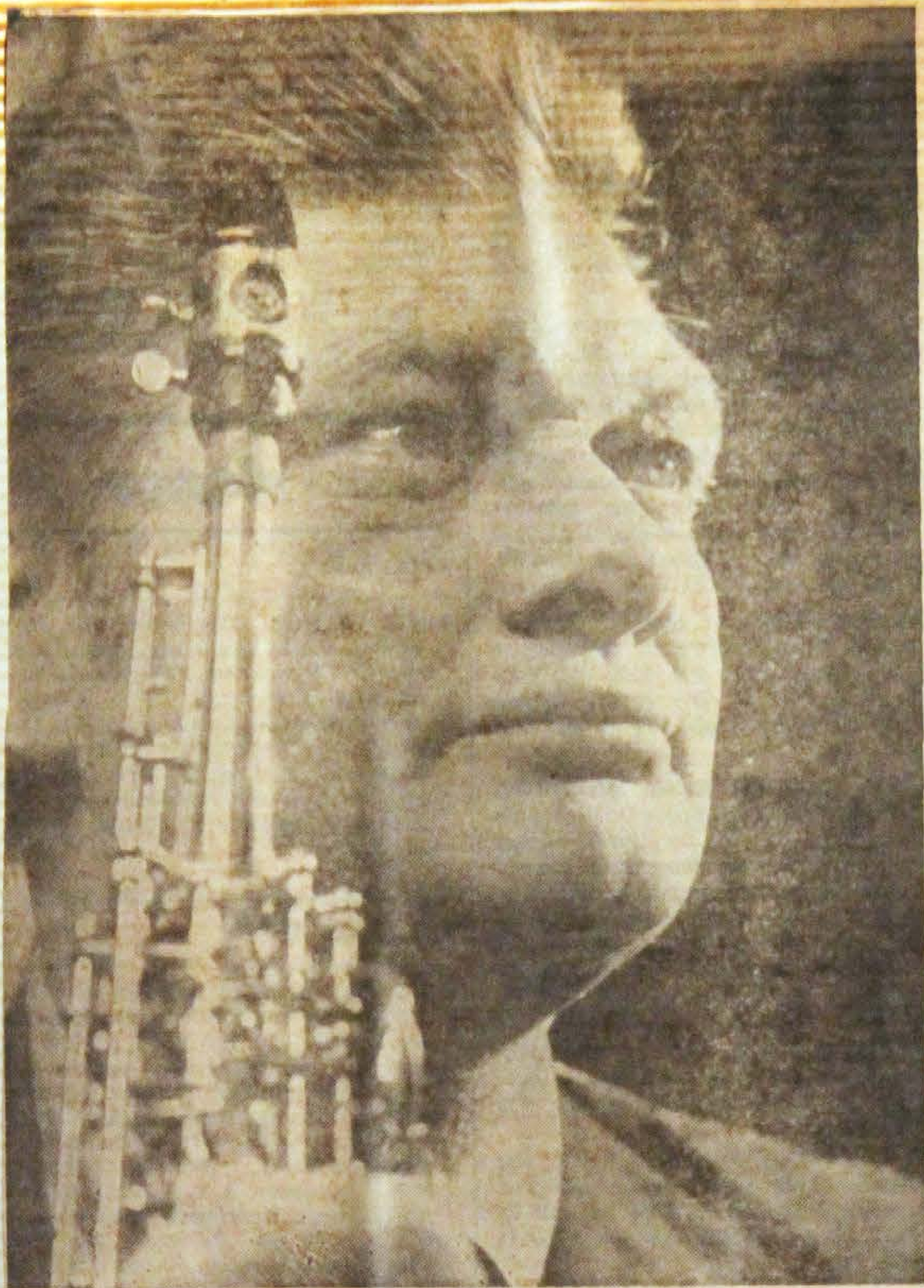
There's some good jazz on tap this weeks at two different concerts. Monday, 8 PM, at the New York University Loeb Student Center on Washington Square South, saxophonist Zoot Sims, at left, will perform in a 'A Jazz Portrait of George Gershwin.'