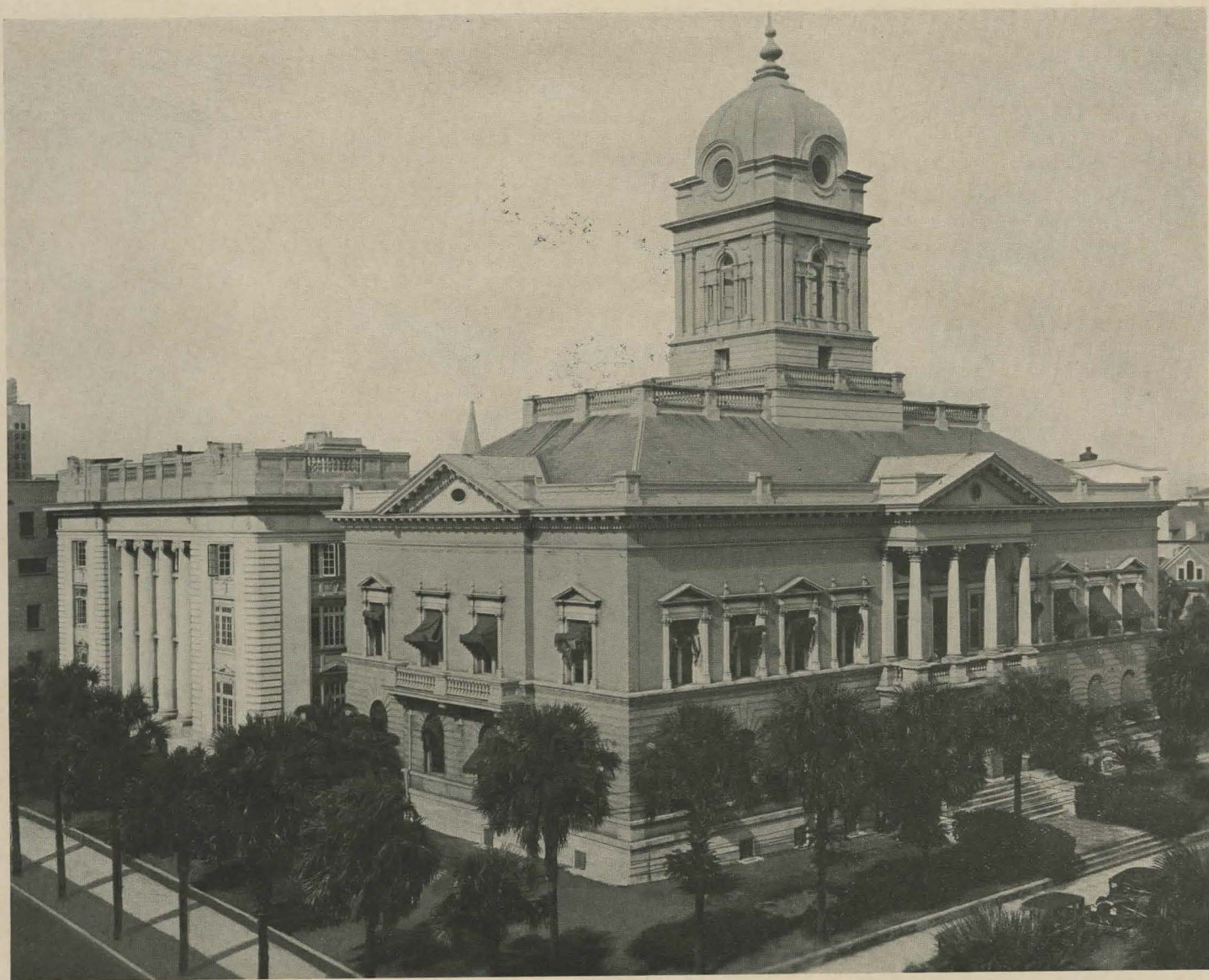
Duval County Court House and Court House Annex, Jacksonville, Florida