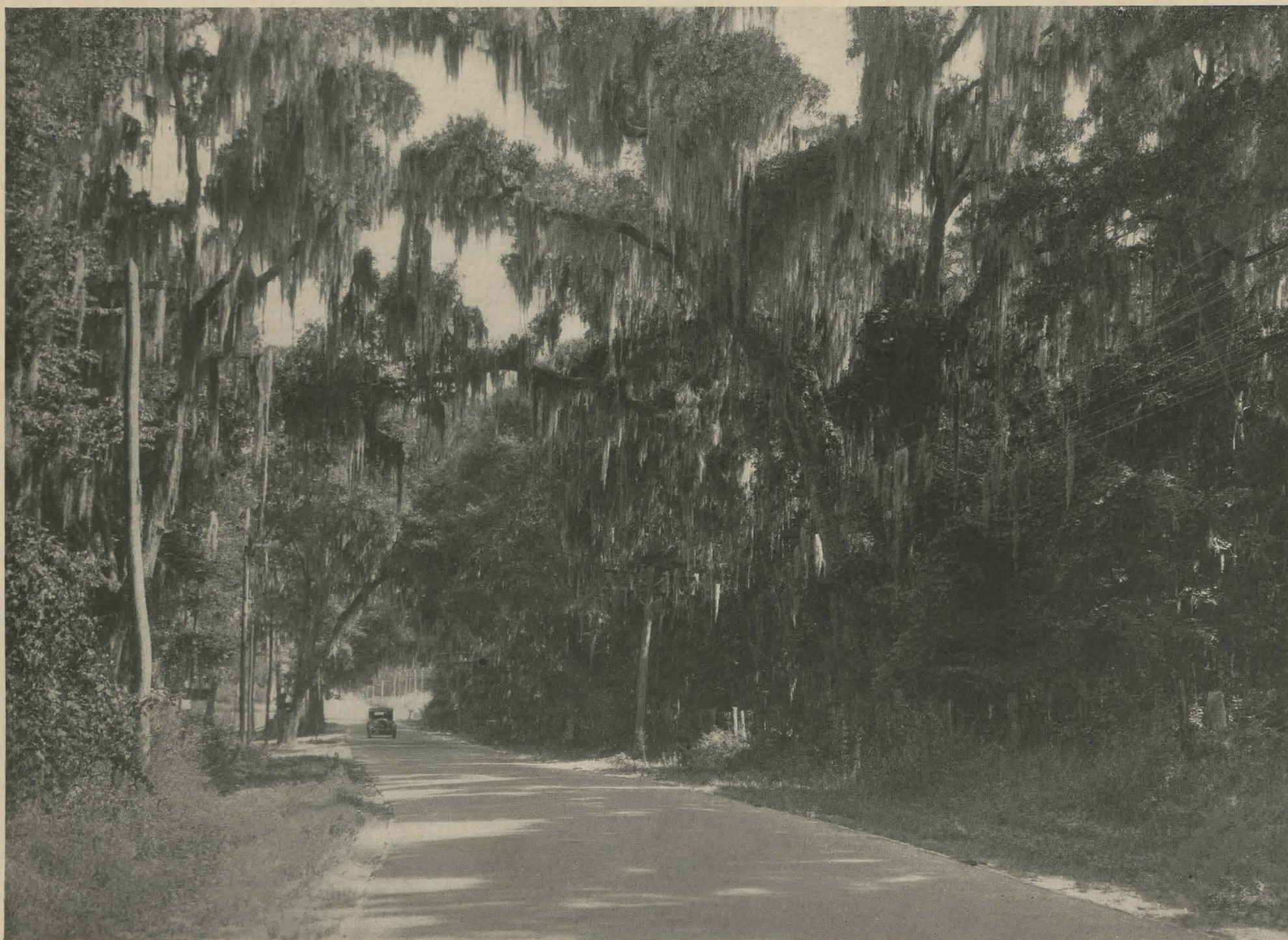
Road Scene, Duval County Florida