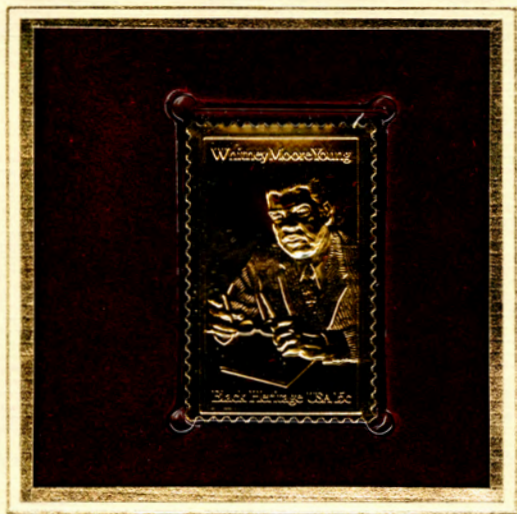
Whitney Moore Young Black Heritage Series