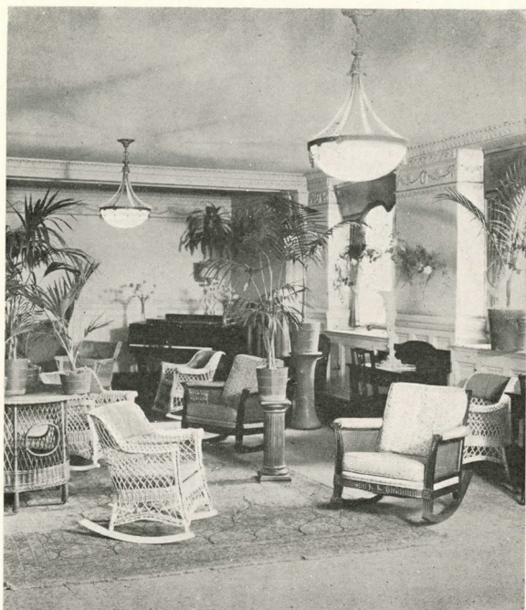
One of the Parlors

after dinner and linger for the Dancing, which starts at nine o'clock.