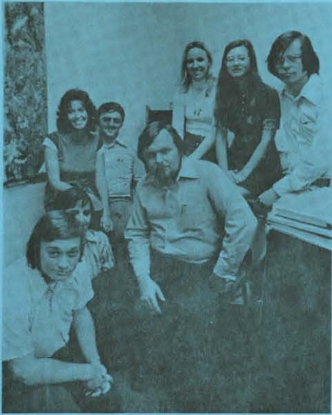
The Psychology Club Membership Drive

The Psychology Club of the University of North Florida extols the development of the mind and the exposure of psychology students to the latest techniques in this growing field of study.