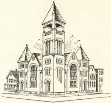
PICTURE OF SCHOOL AND CHURCH BUILDING ERECTED BY BETHEL CHURCH IN 1896, AND BURNED IN THE GREAT JACKSONVILLE FIRE OF 1901.

This was the first Institutional Church building ever erected in the South by a colored church. It was built of red pressed brick and trimmed with Georgia Marble. The building contained a main auditorium with a seating capacity of 1150, and nine class rooms, and cost $26,000. It was erected by colored mechanics under the direction of colored contractors, and was at the time of its erection, the most convenient and attractive church building in the city.