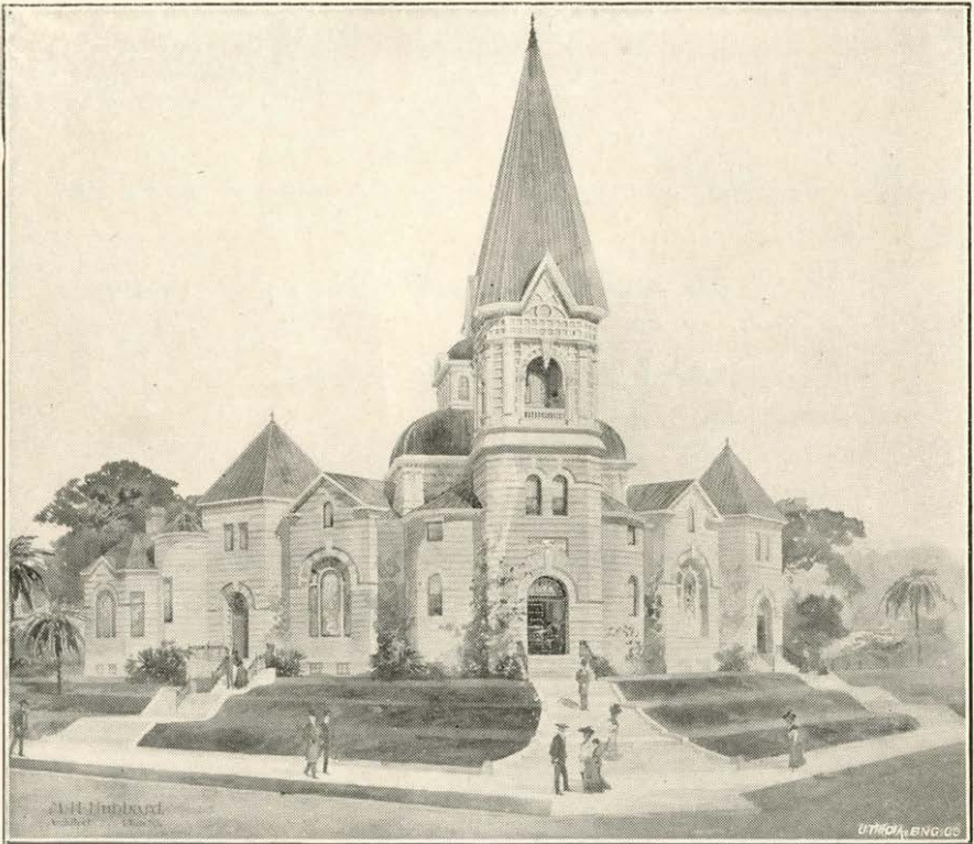
FRONT VIEW OF BETHEL BAPTIST INSTITUTIONAL CHURCH N. W. CORNER HOGAN AND CAROLINE STS.

—◆— “Walk about Zion, and go round about her; tell the towers thereof” — Psalm XLVIII: 12.