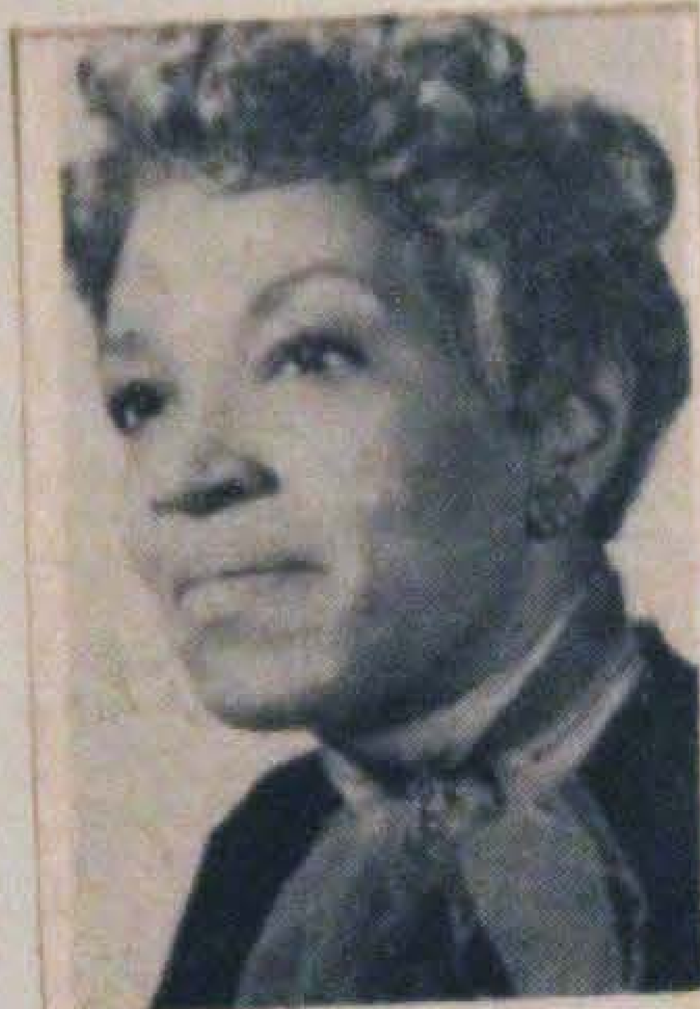
Maxine Sullivan is a special guest star in "Highlights in Jazz," featuring Zoot Sims, Joe Newman, Phil Bodner, Hank Jones and Bucky Pizzarelli, Monday at NYU's Loeb Center.