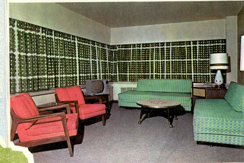
Bed-Sitting Rooms. Restful lounging during the day and comfortable sleeping at night.