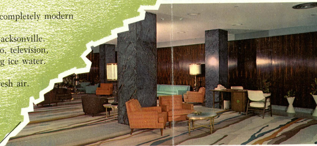
Colorful street-level Lobby with all Major Airlines Offices, Shops, and Drug Store.

The South's newest and largest completely modern commercial-convention hotel in the very heart of downtown Jacksonville. 510 outside rooms, all with radio, television, Hi-Fi, tub-shower and circulating ice water. The very finest of noiseless air conditioning, using 100% fresh air. All water treated to rainwater softness. 200-car underground garage.