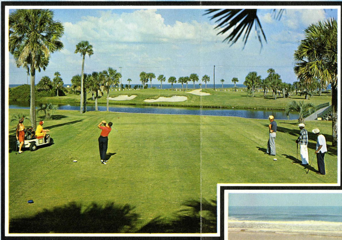
The Famous 16th Tee at Beautiful Ponte Vedra, skirting the Atlantic.

Jacksonville Beach, noted for its recreational facilities. The finest Beach on the Atlantic Coast. Only 16 miles away—double lane highway.