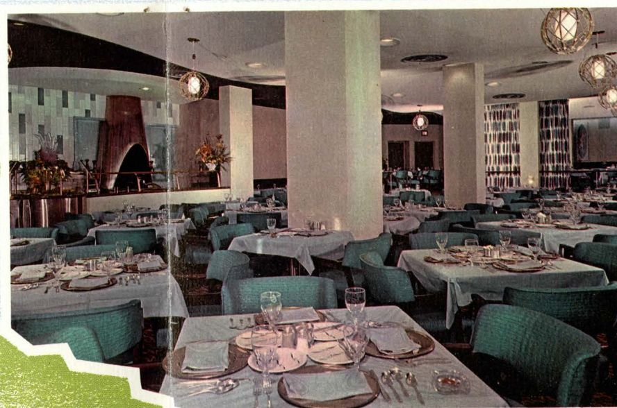
Cafe Caribe with its huge Copper Grill where Charcoal Delicacies are prepared before your very eyes.

Complete facilities on a single floor for conventions up to 1200. Meeting rooms, large and small. Exhibit Hall, 5000 square feet, adjacent Ballroom. Theatre-type lighting and sound system. All equipment needed for a successful Convention.