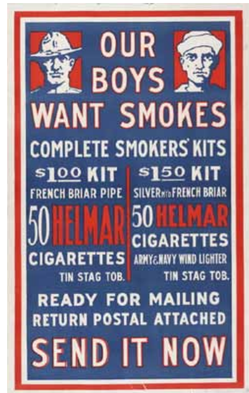
Figure 2: Wartime Tobacco Advertisement