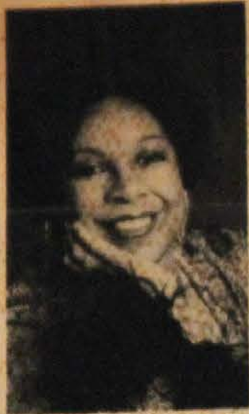
Helen Humes stars in "Highlights in Jazz" final concert of the season at 8 p.m. at NYU's Loeb Student Center. For info call 598-3757.