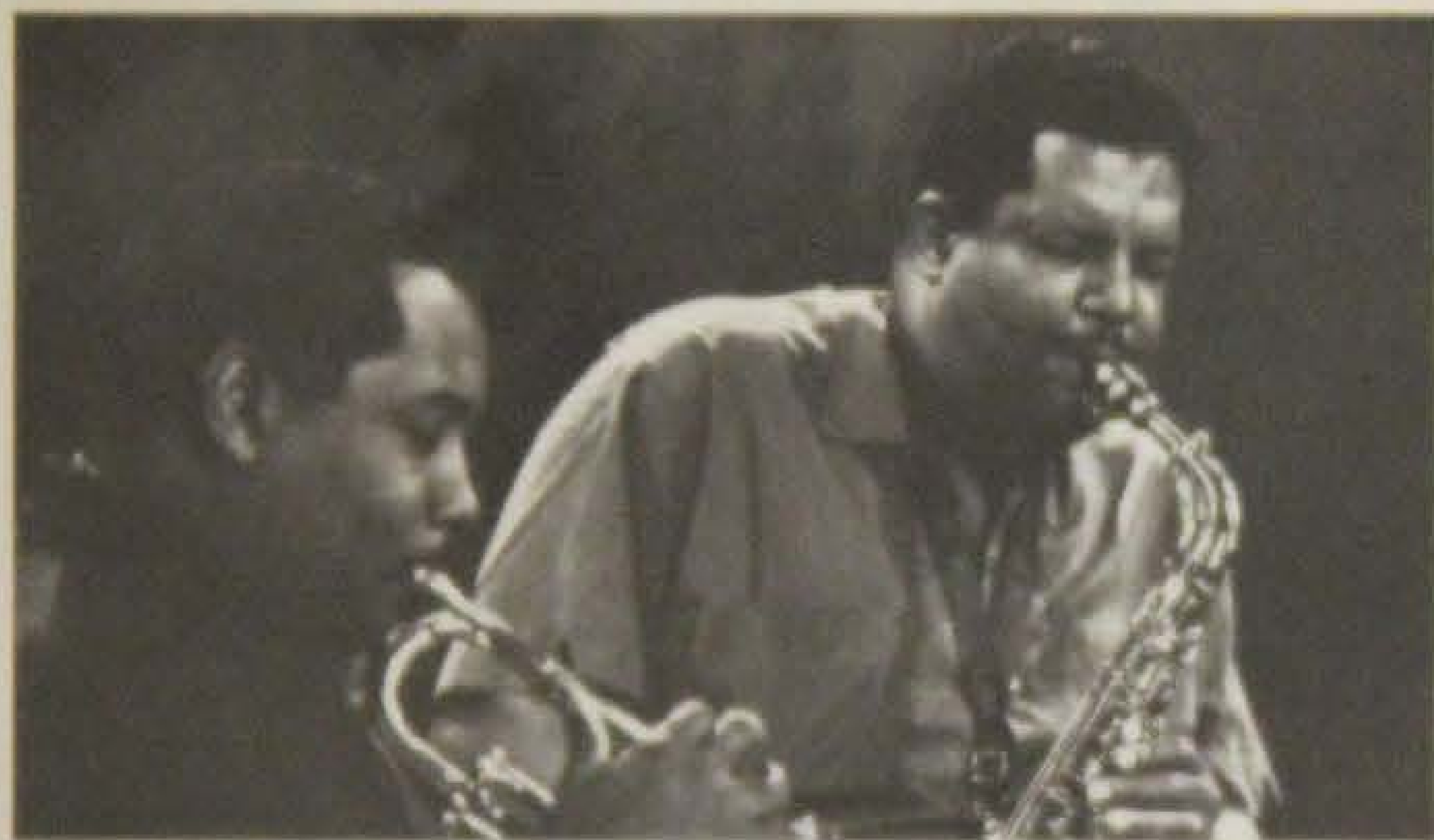
Nat and Cannonball Adderley