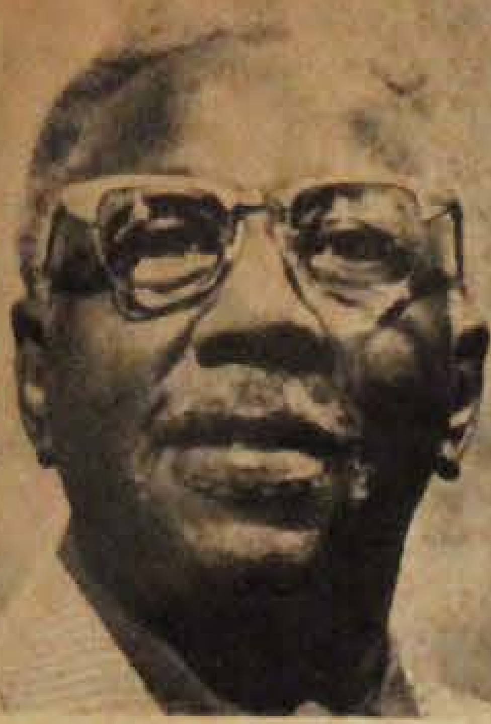
Roy Eldridge is slated to be a NYJRC honoree at Newport '77

NEW YORK—The Newport Jazz Festival will present its sixth annual bash in this city from June 24 through July 4. In those 11 days the music ringing from the concert halls, the streets and the Staten Island Ferry will include the likes of vocalists Sarah Vaughan, the Pointer Sisters, Betty Carter, Mel Torme, Mabel Mercer, Joe Williams and Big Joe Turner, the big bands of Woody Herman, Thad Jones & Mel Lewis, Horace Henderson conducting the New York Jazz Repertory Company, Maynard Ferguson, Stan Kenton, Count Basie, the NYJRC (in a tribute to Earl 'Fatha' Hines and Roy Eldridge) and Sy Oliver.