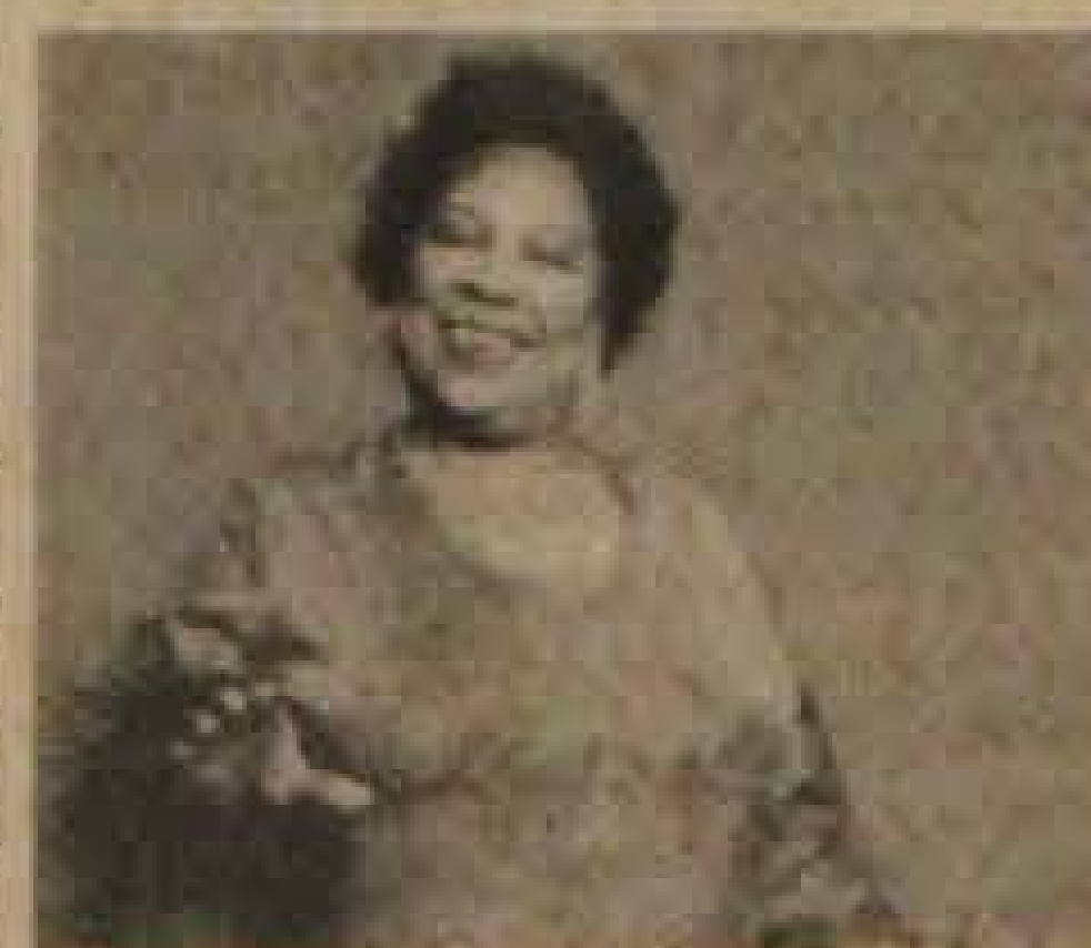
Helen Humes stars in "Highlights in Jazz" at NYU's Loeb Student Center, 8 pm.