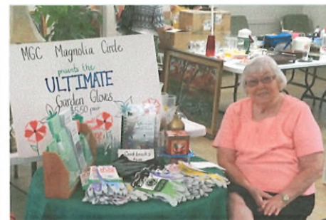
Thanks to Magnolia Circle and their glove sales for funding the purchase of a new stove for the Clubhouse kitchen.

Halloween, Veterans Day, Thanksgiving--it's that holiday time of year, with the big one fast approaching. Two Christmastime announcements to note: