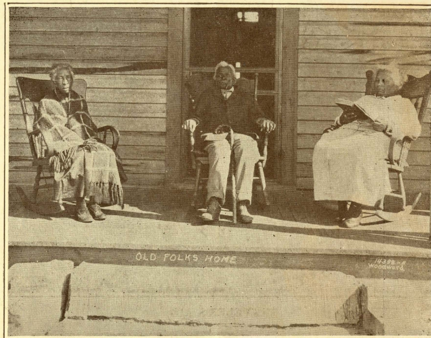
HOMÉ FOR THE AGED

of the financing of these agencies be given by the people for the benefit of whose race the fund has been established.