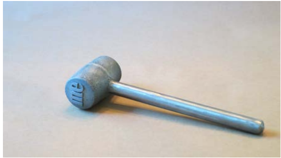
|you| |me| (hammer) Cast Iron, 10" x 2" x 3.5", 2017 nfs