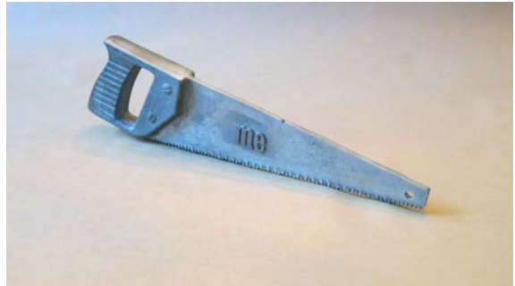
|you| |me| saw Cast Iron, 14" x 3.5" x 1", 2017 nfs