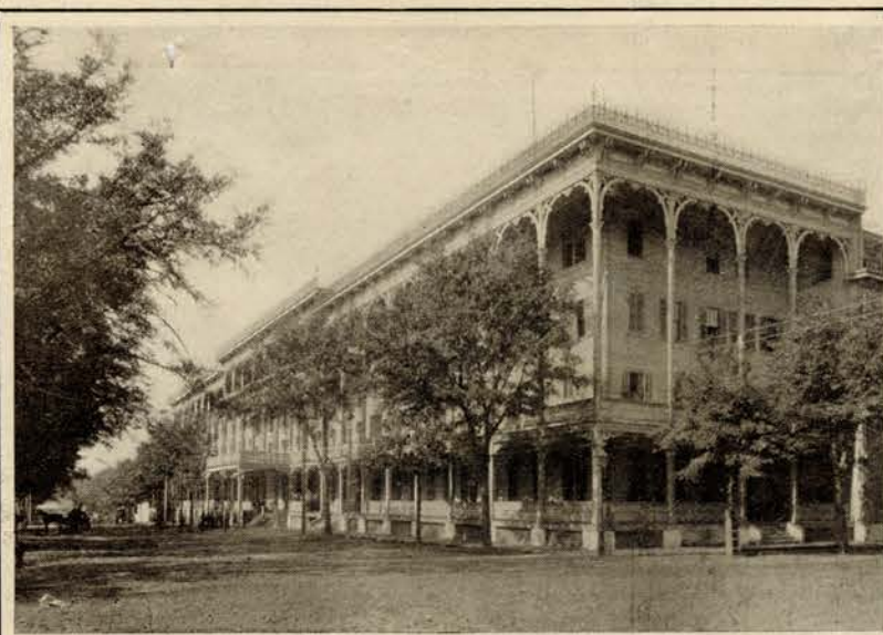
THE NOTED ST. JAMES HOTEL, A POPULAR WINTER RESORT, COMPLETELY DESTROYED.