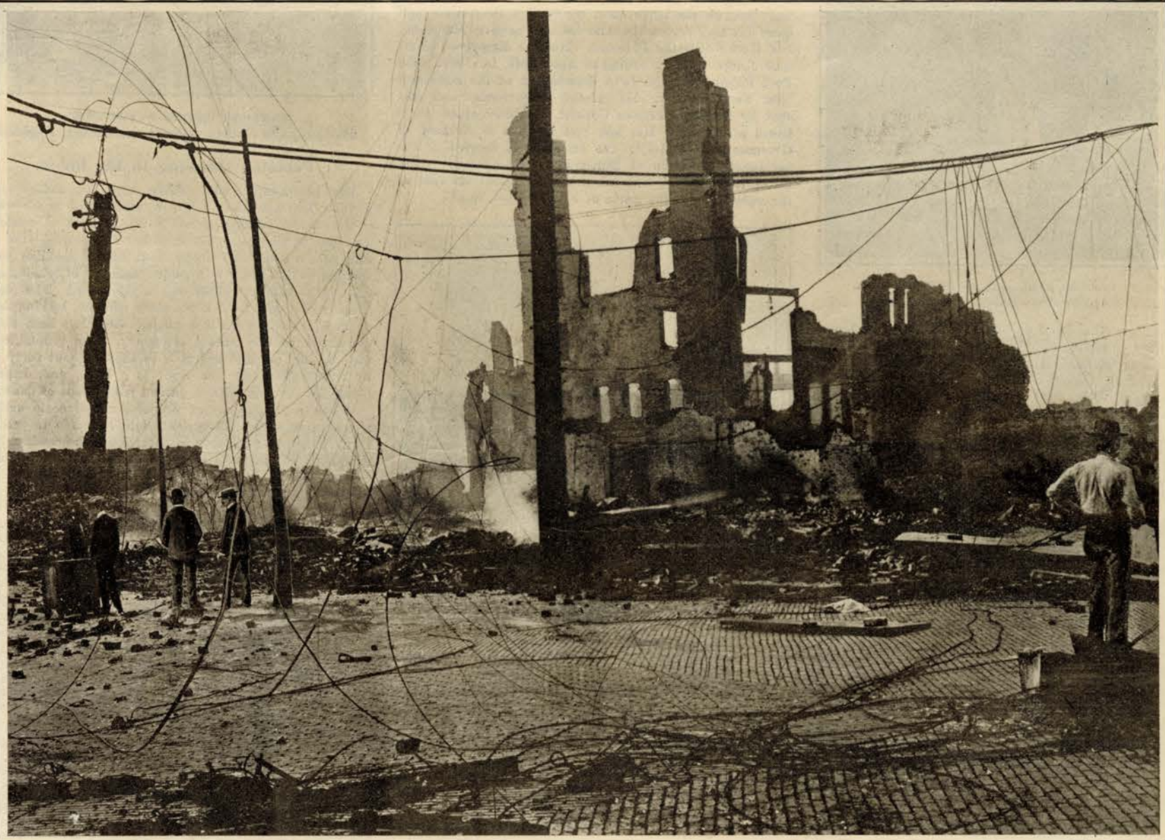
DESTRUCTION WROUGHT IN THE HEART OF THE RETAIL MERCANTILE SECTION—RUINS OF THE HUBBARD AND FURCHGOTT BUILDINGS, LOOKING SOUTHEAST FROM THE FIRST NATIONAL BANK.