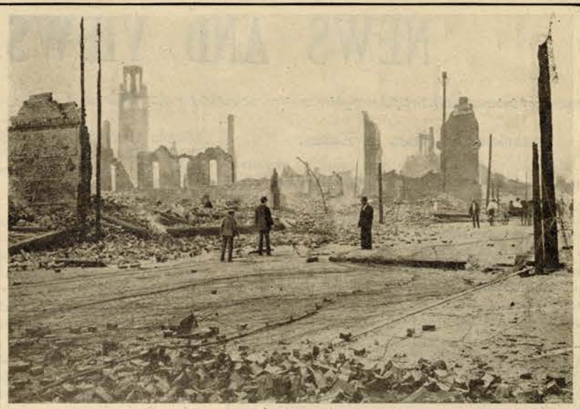
RUINS OF THE CITY BUILDING AND AUDITORIUM, LOOKING SOUTHEAST FROM MAIN AND FORSYTHE STREETS.