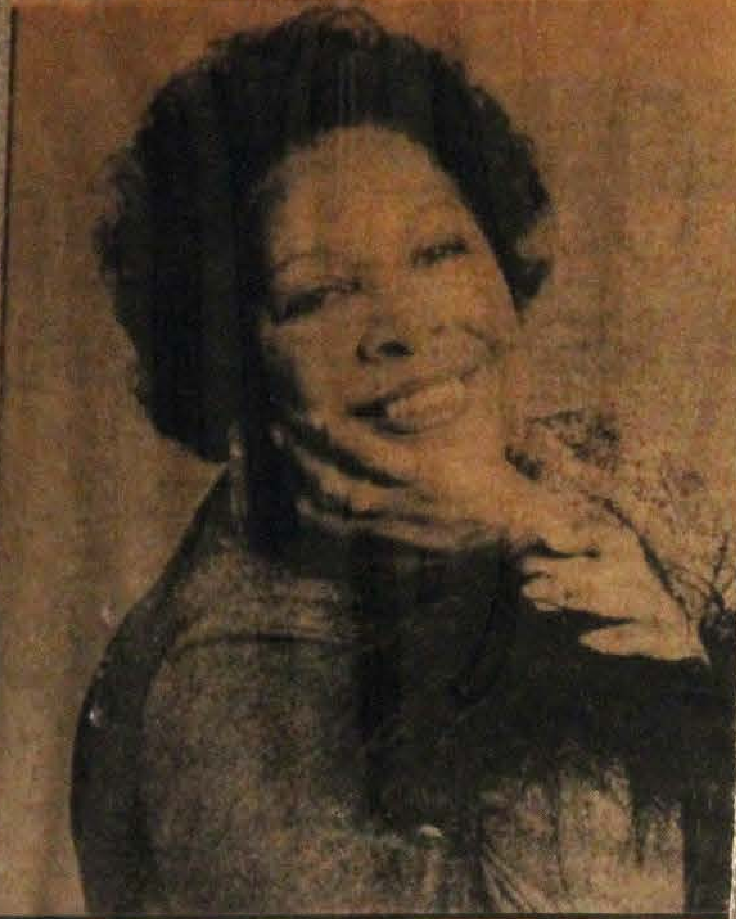
Helen Humes 9/28