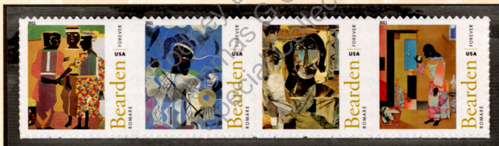
Art © Romare Bearden Foundation/Licensed by VAGA, New York, NY; background: Albright-Knox Art Gallery/Art Resource, NY; intaglio: Courtesy Romare Bearden Foundation; left: Wadsworth Atheneum Museum of Art/Art Resource, NY; top right: Art Resource, NY; bottom right: © Marvin E. Newman, courtesy Bruce Silverstein Gallery, New York.

Stamps printed by Avery Dennison (AVR) / No. 881 in a series / September 28, 2011 / Printed in U.S.A. / © 2011 United States Postal Service