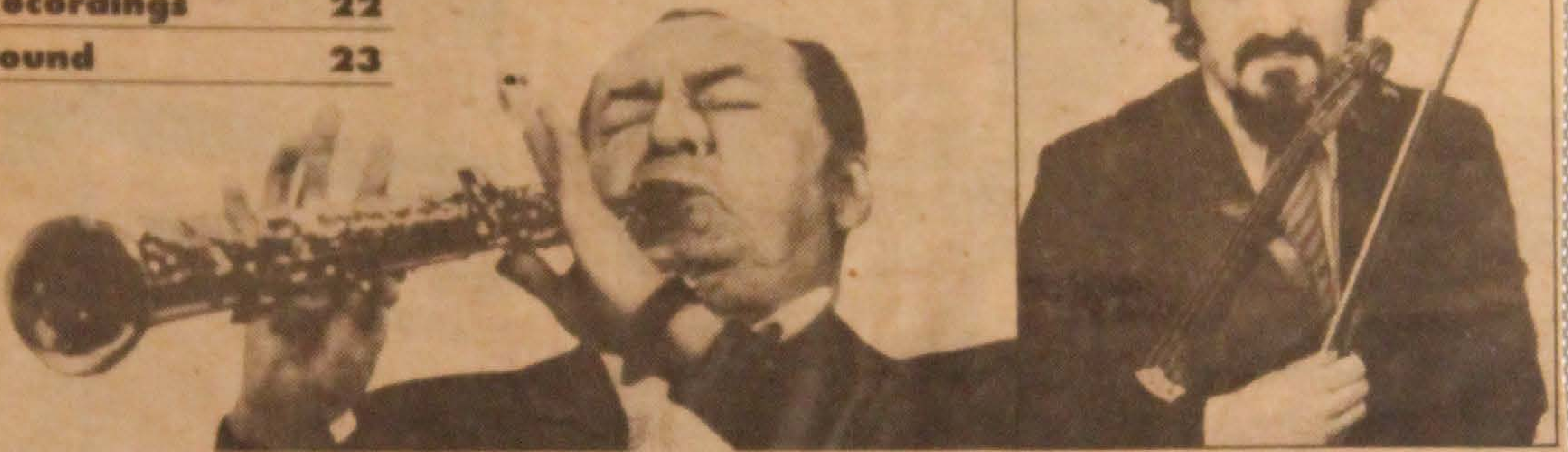
Woody Herman, left, with his Thundering Herd will give two concerts on Thursday at NYU's Loeb Student Center; Pinchas Zukerman will perform in two all-Brahms recitals at Carnegie Hall on Wednesday and Saturday.