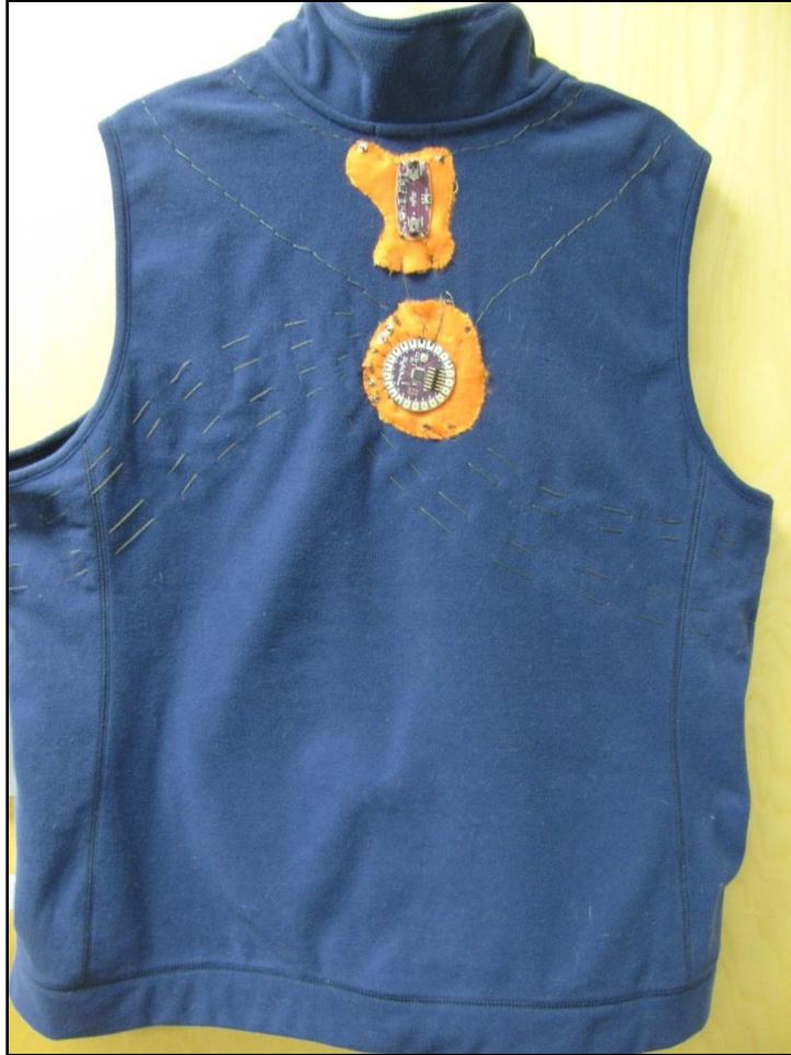
Figure 4: Rear View of Prototype