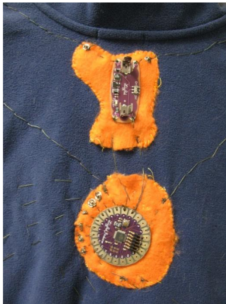
Figure 1: Mainboard and Power Supply on Back of Vest

We sewed the Mainboard and power supply onto felt patches that were sewn onto the outer rear portion of the vest just below the neckline (Figure 1). We connected the buttons to the MainBoard using conductive thread, and then covered each button with felt patches to protect the contacts (Figure 2). A full view of the front and back of the vest are show in Figures 3 and 4.