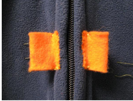
Figure 2: Button Board on Front of Vest