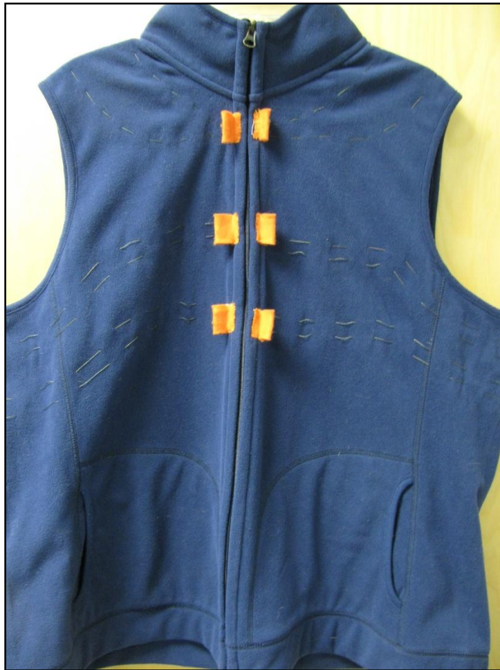
Figure 3: Front View of Prototype