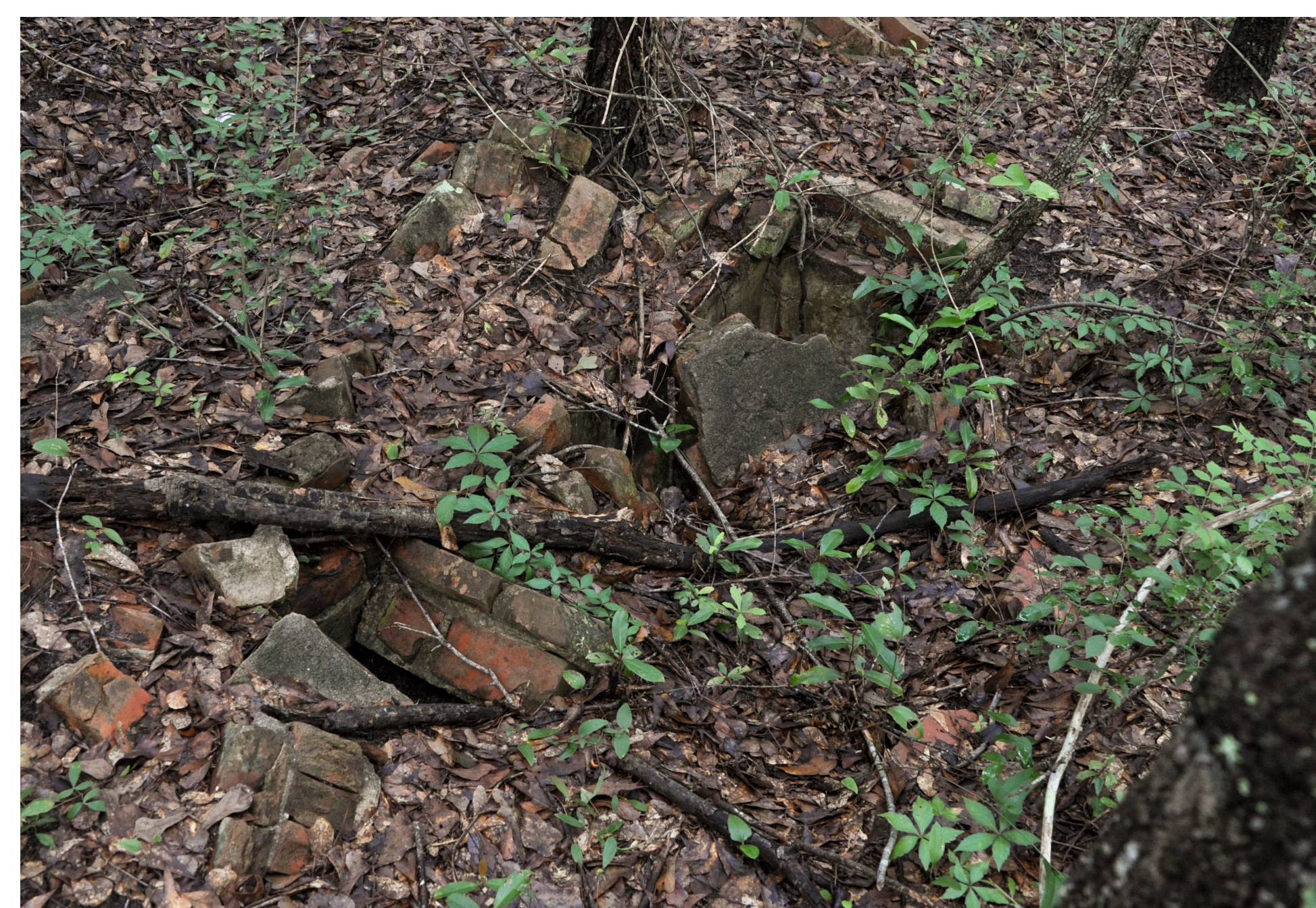
Current State of the Cemetery

The research team is developing a virtual cemetery that will include a searchable database linked to digitized death certificates, audio recordings and transcriptions of selected oral histories, and multi-layered, interactive maps. The project will also include aerial drone photography, GPR, GIS, and thermal mapping data. Using this data, we will be able to digitally reconstruct much of the original layout of the cemetery and more accurately assess both the number of graves and their connections to each other. The 800 names already identified by