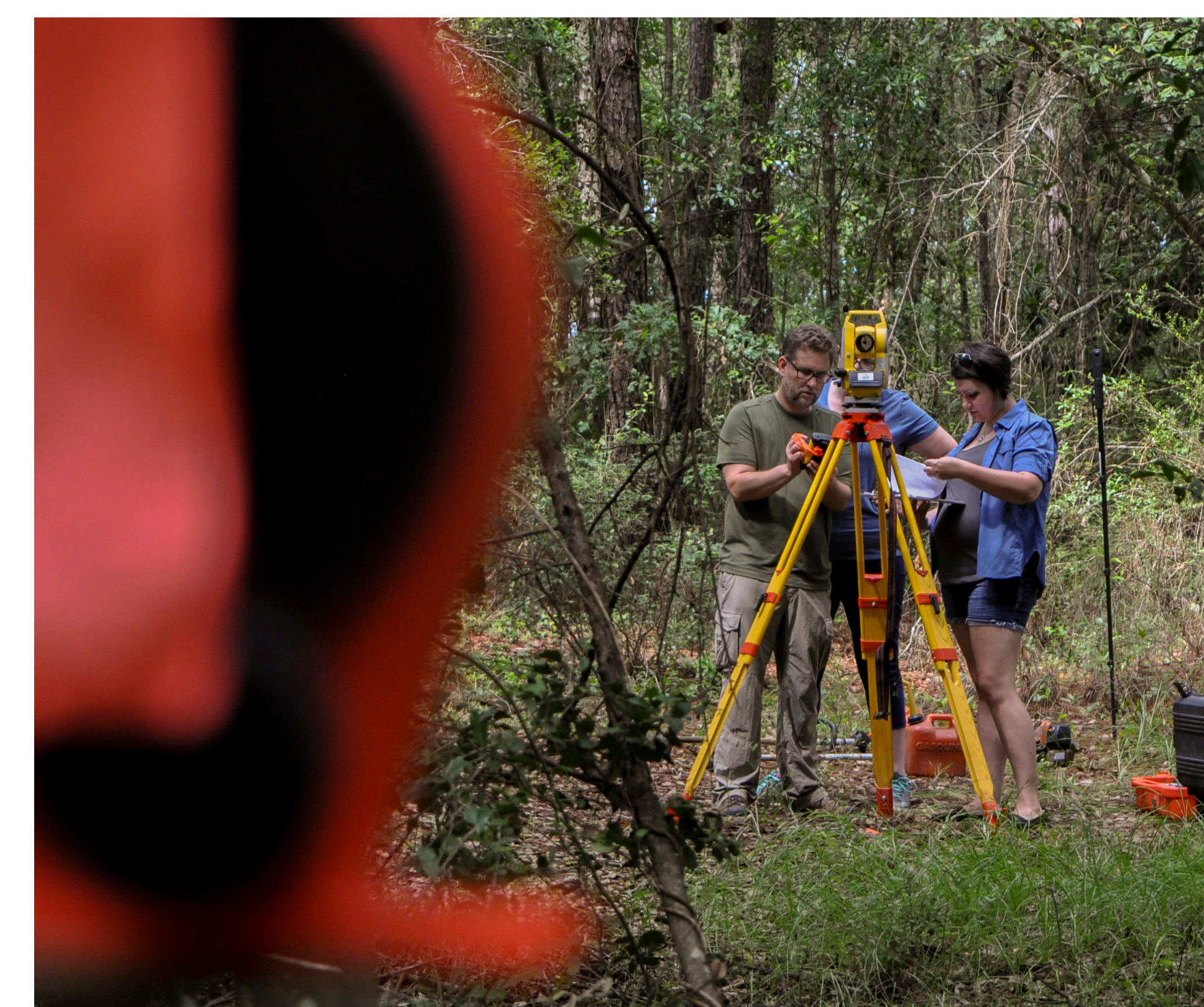
Students and Faculty Survey Site

the Okefenokee Heritage Center will serve to produce a searchable database of family names, dates, and other biographical information. Future projects will include a documentary film and the collection and curation of oral histories to preserve, publicize, and record voices from the Waycross community. The virtual cemetery will also provide a valuable archive for scholars working in African-American history and related fields as well as a resource for K-12 teachers.