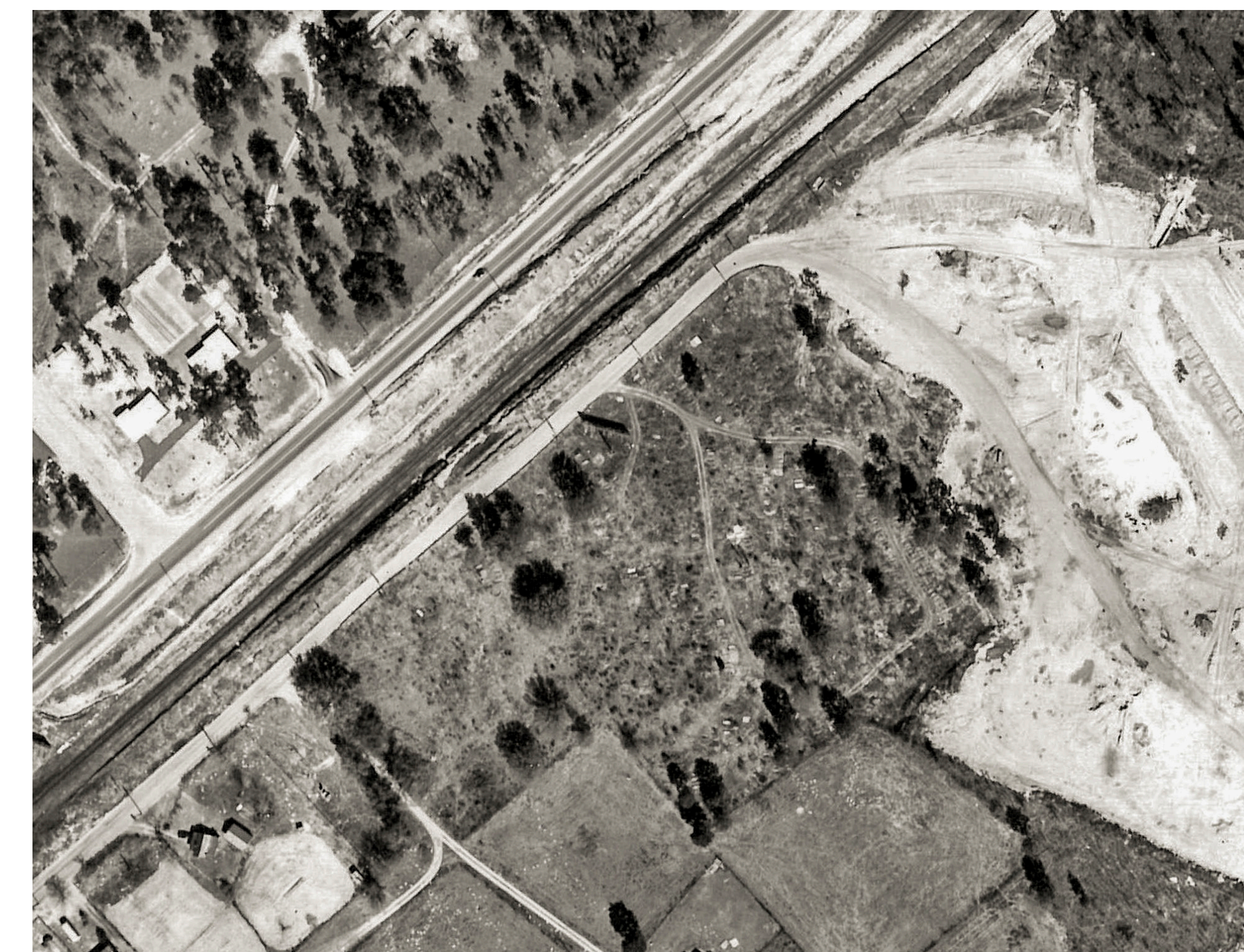
Aerial View, 1954

2000 burials, some of them dating from the 1800s, the cemetery, even in its current condition, memorializes the lives and struggles of an African-American community during a period of monumental political, social, and cultural change. By mapping and recording graves, developing a database of names and dates, and conducting oral histories of surviving family members, the Red Hill Cemetery Project will record often-neglected voices before they fall irretrievably silent.