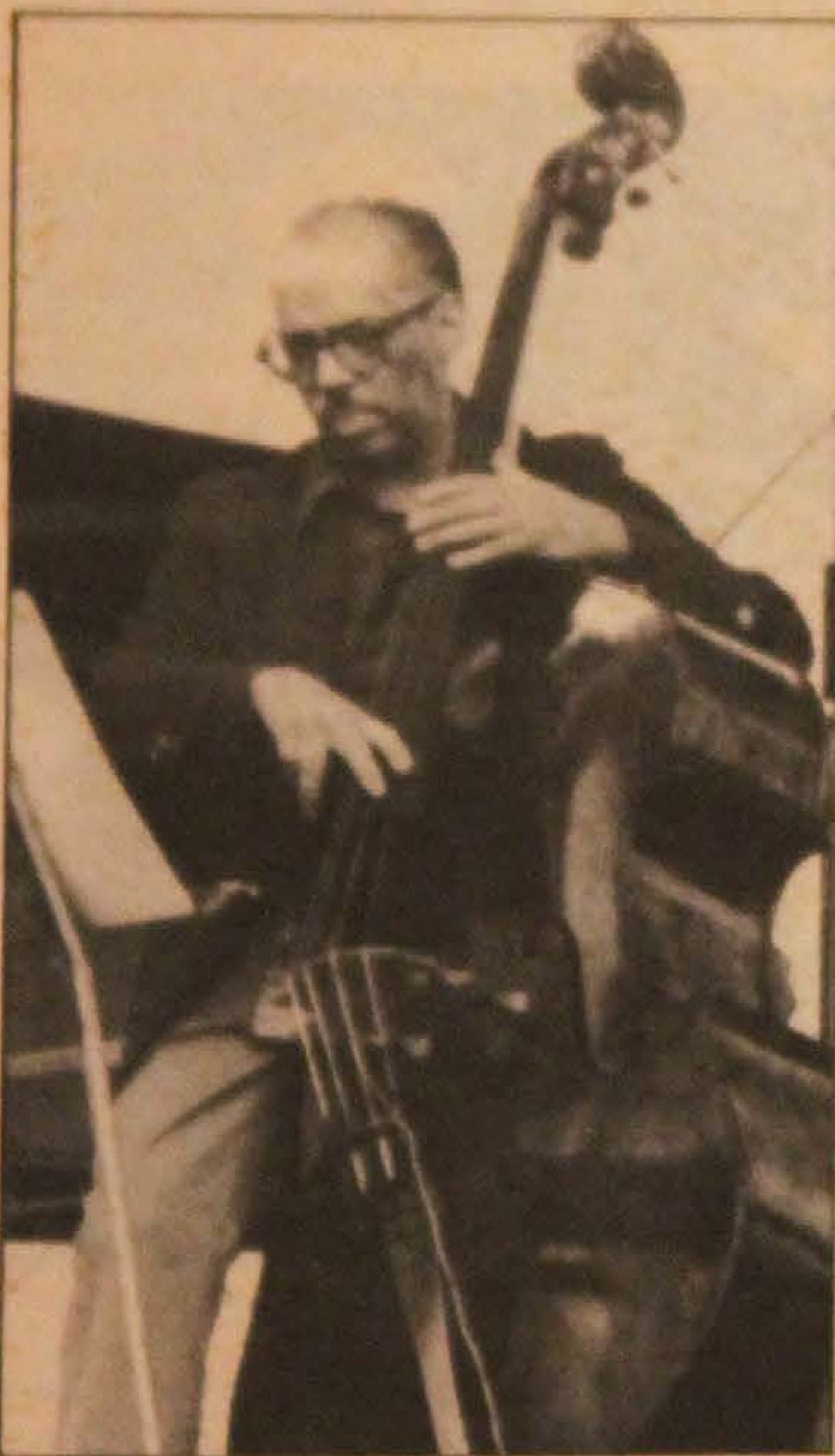
George Duvivier — magnificent timekeeper, versatile jazzman, animal lover

One of those people is George Duvivier. Every once in a while I like to fantasize about what grouping I would make if I could choose the players for one concert or