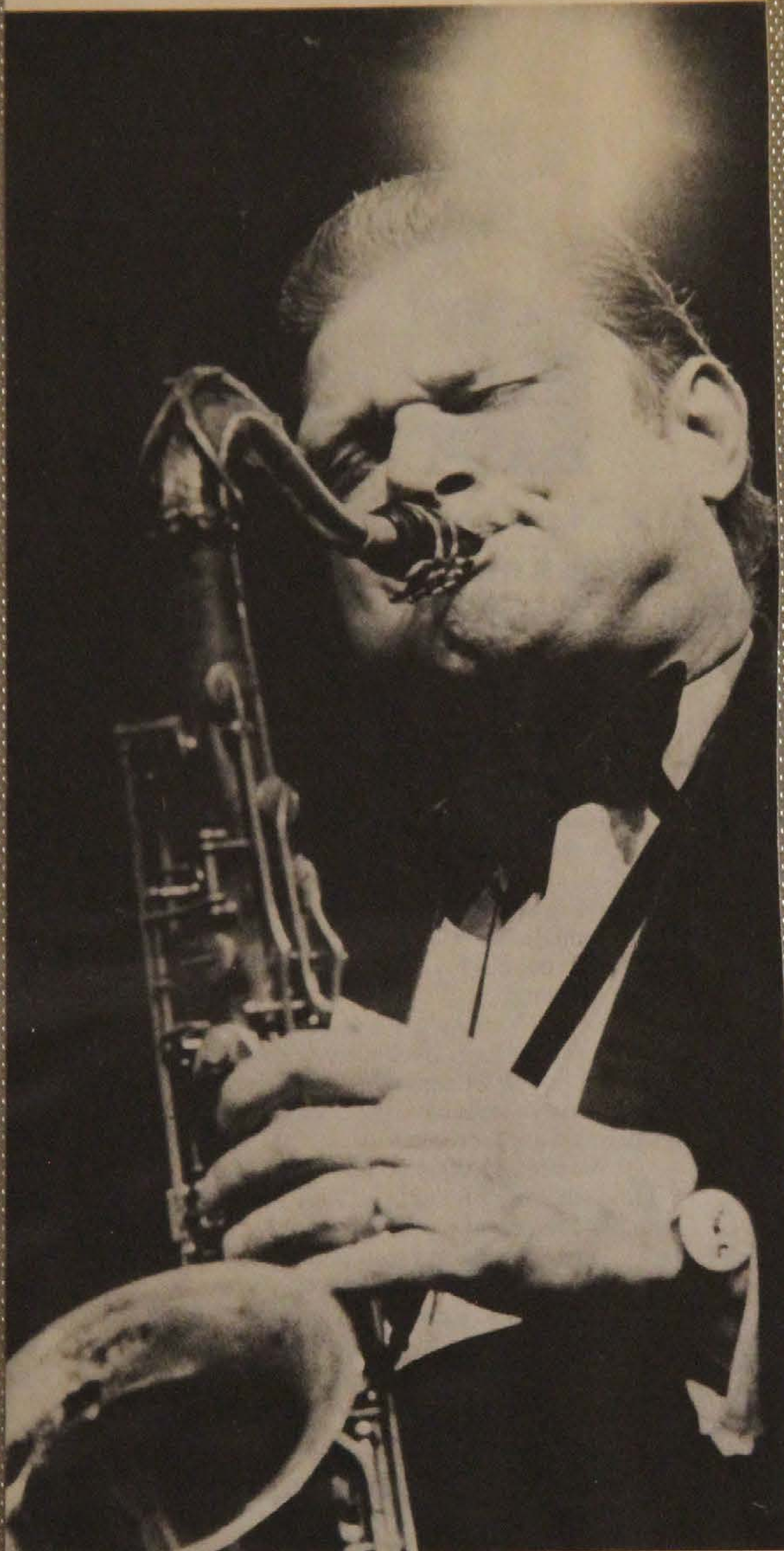
Zoot Sims is featured in the Highlights in Jazz Salute to Bassist George Duvivier . The concert takes place at NYU Loeb Student Center, 566 LaGuardia Pl. on March 11. See Music Directory for details.