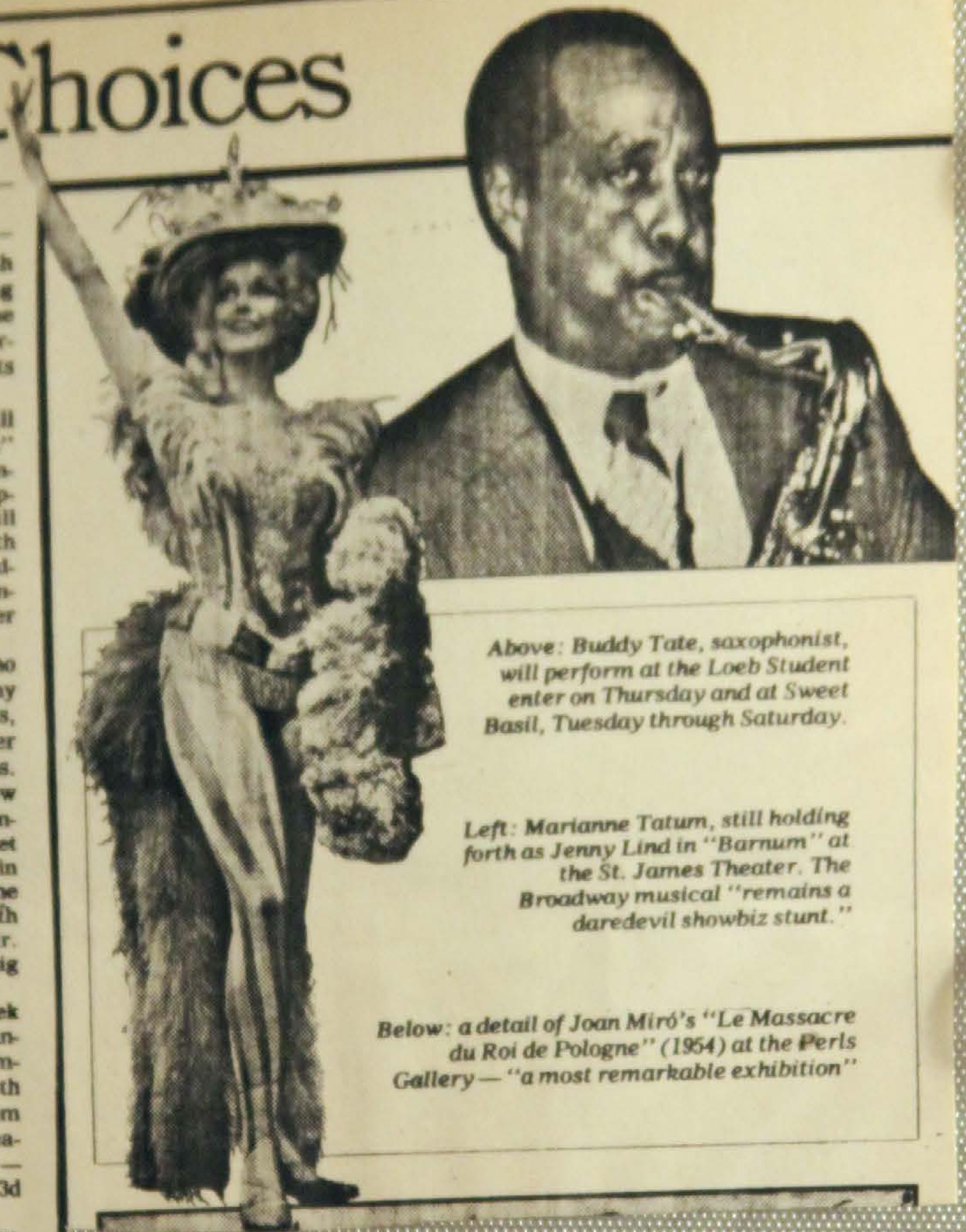
Above: Buddy Tate, saxophonist, will perform at the Loeb Student Center on Thursday and at Sweet Basil, Tuesday through Saturday.