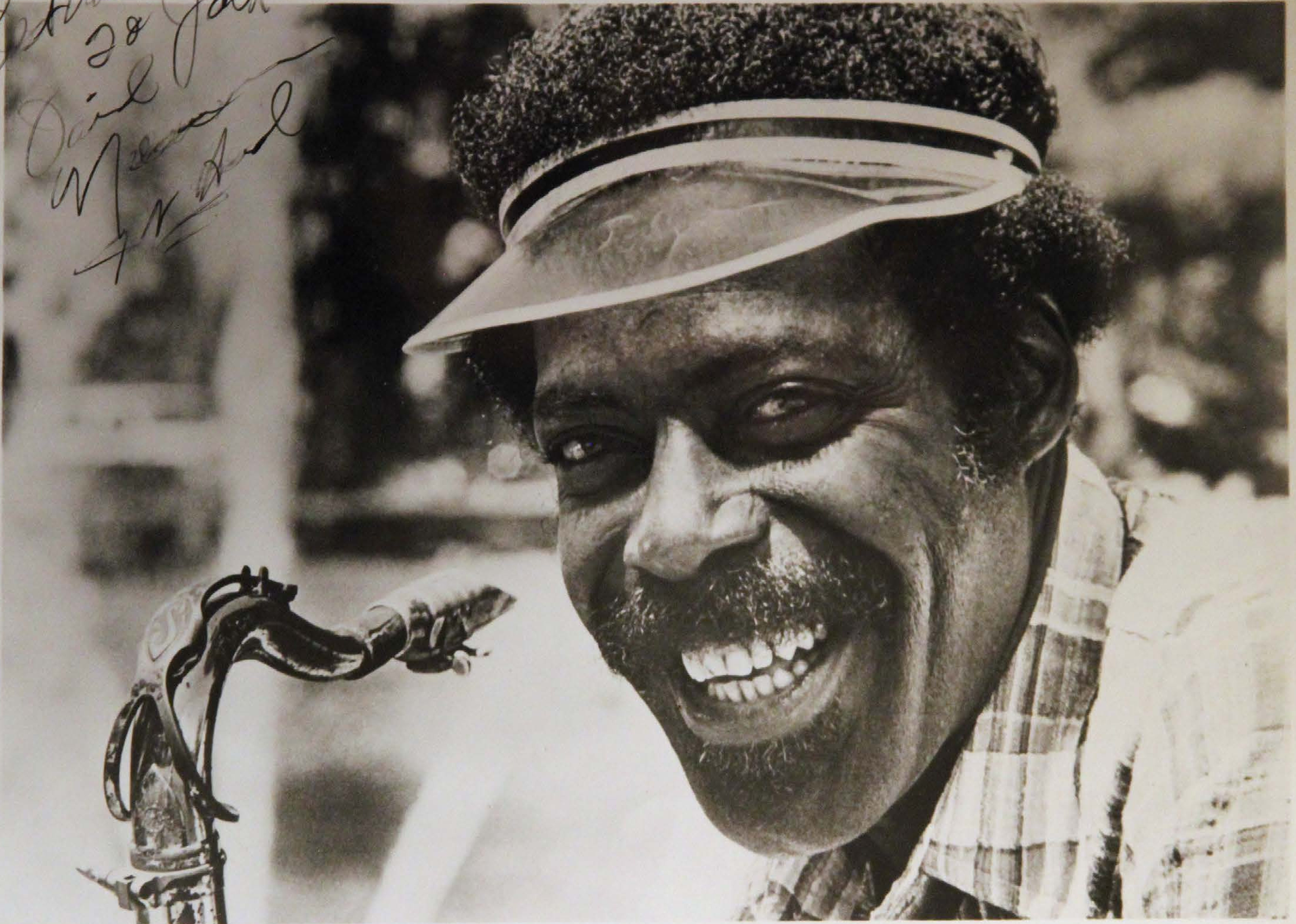
DAVID FATHEAD NEWMAN