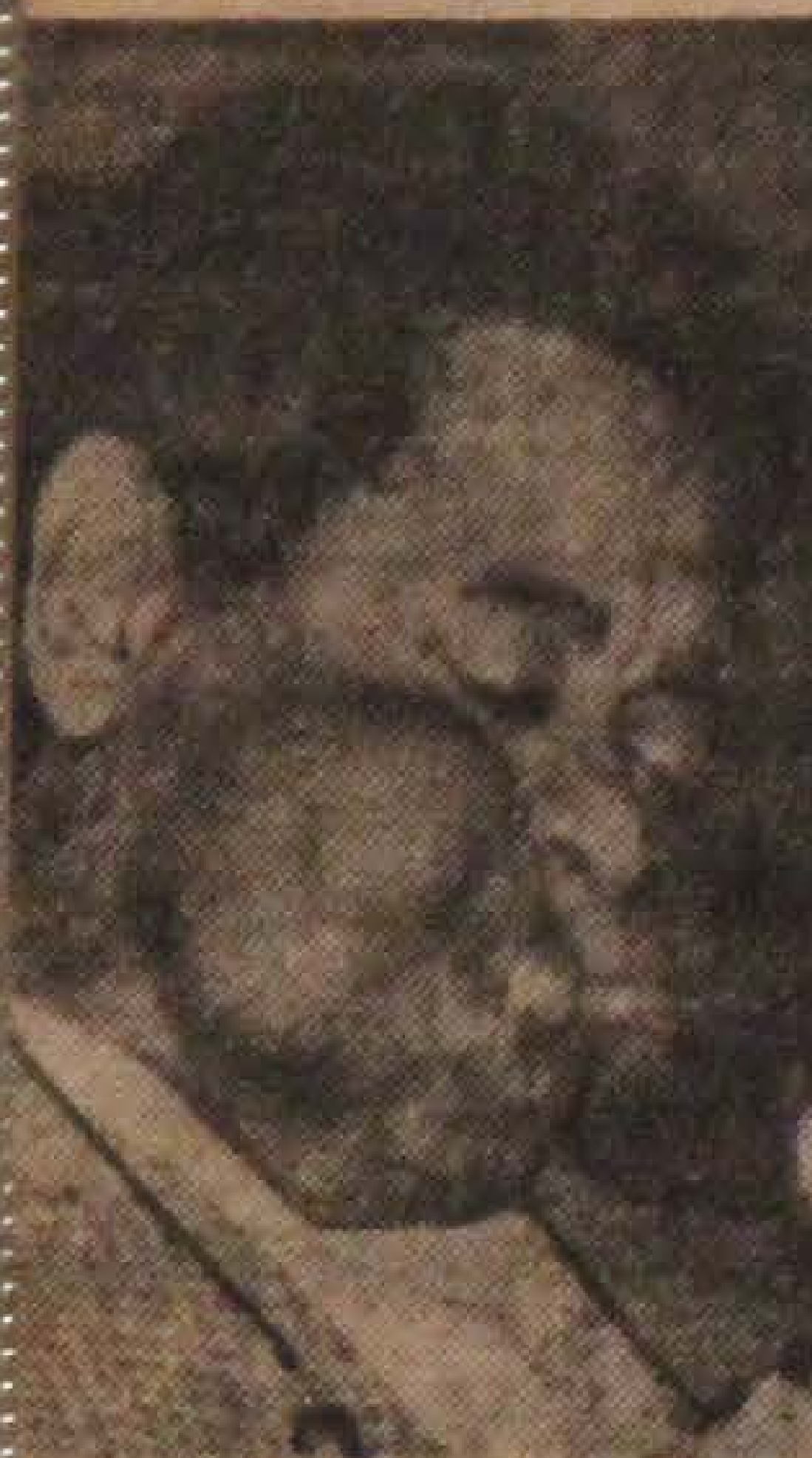
DIZZY GILLESPIE Village Gate