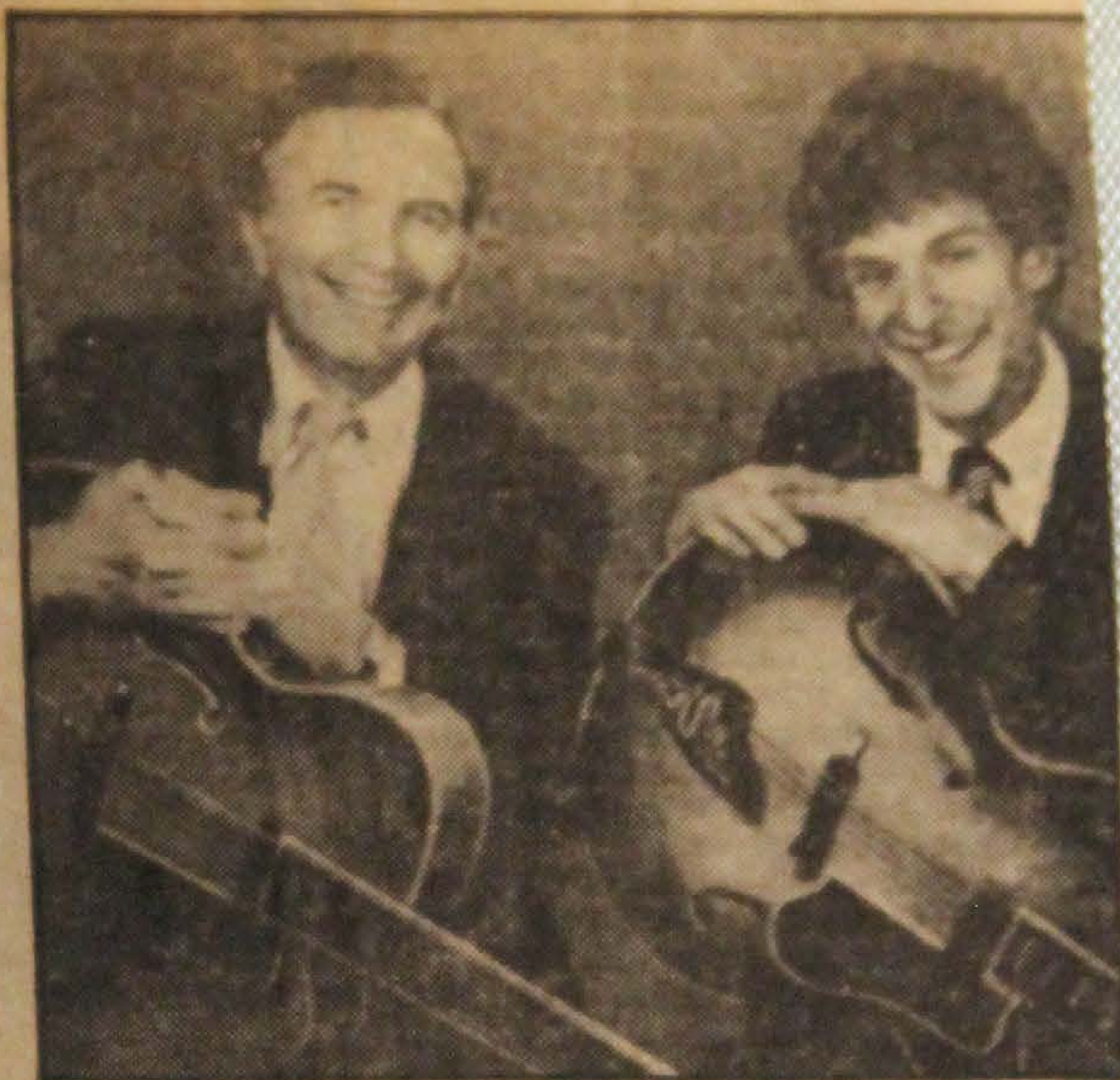
Bucky (l.) and John Pizzarelli Jr.