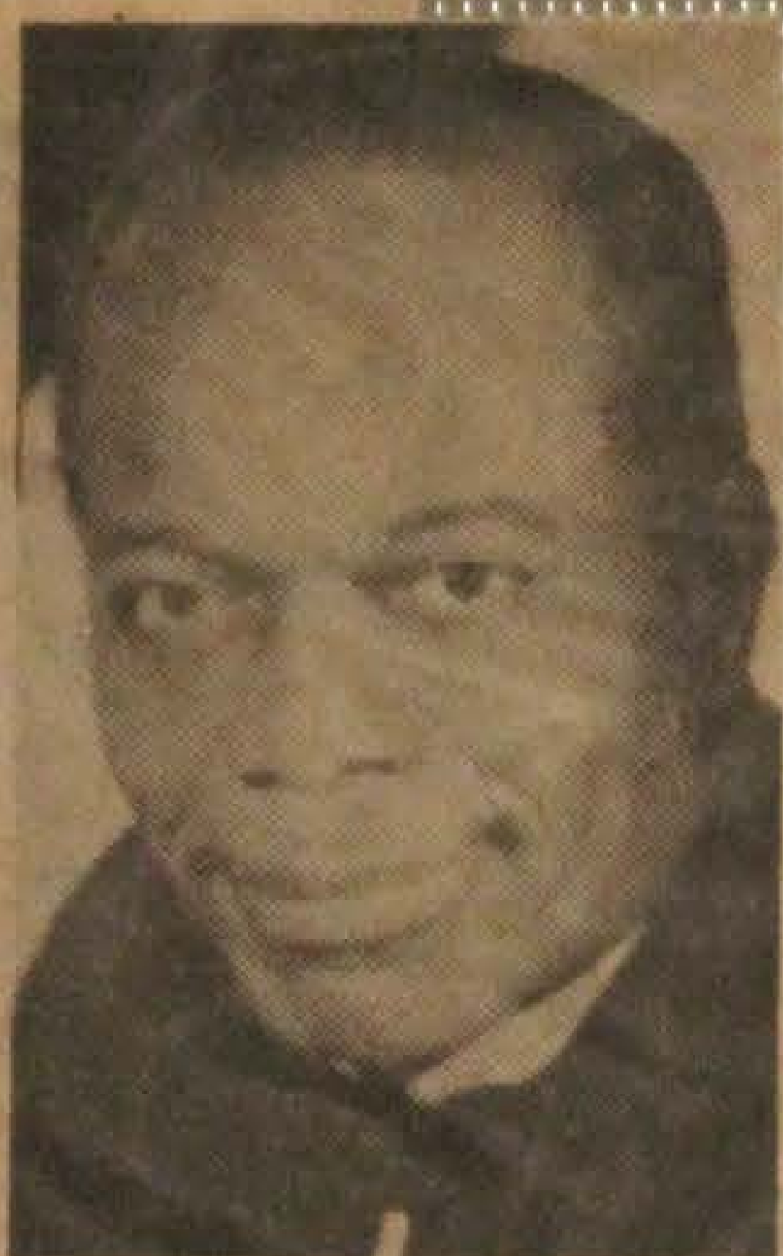
Pianist Hank Jones to be honored tonight.

"To be recognized by my peers is always an honor," Jones says. "I would have been happy if any of two or three hundred musicians had been