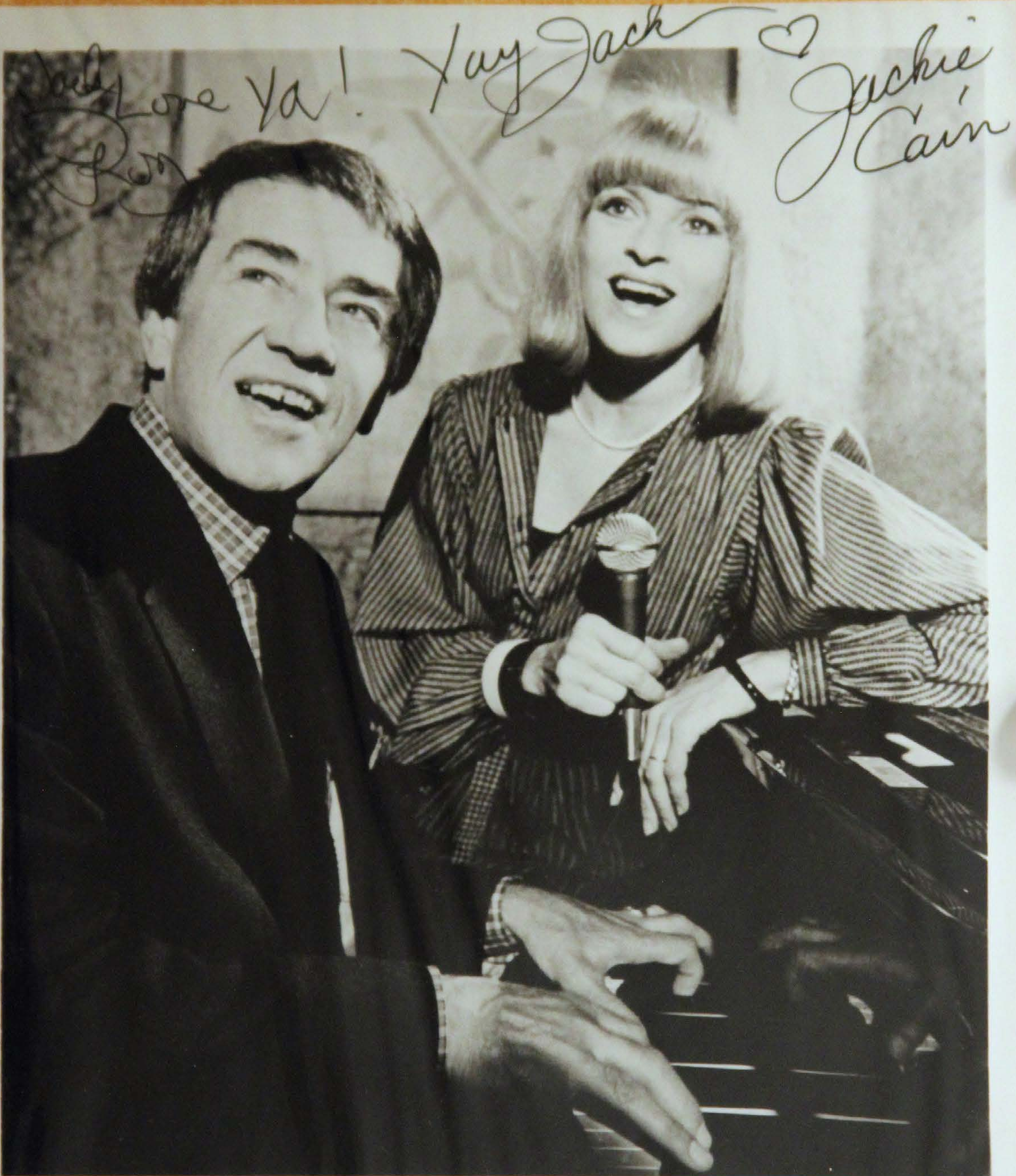
Jackie Cain & Roy Kral