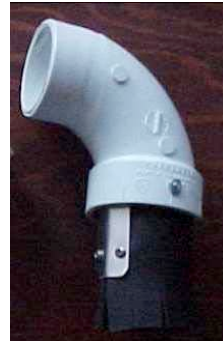
Figure 8. 90° Attachment and boot.

attached. The prototype requires a cap to maintain pressure during operation. The final prototype is shown in Figure 9 and 10.