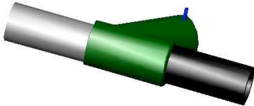
Figure 3. Sample shunt design.

The device design originates from a simple straight pipeline from the tanker. The device attaches to the tanker pipeline section and provides a 45° secondary exit opening for the material. The image below illustrates the connected system, Figure 3.