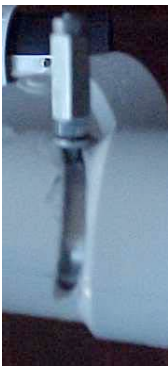
Figure 7. Collector movement lever.

The bolt acts as a lever for engaging and disengaging the collector. The pipeline has a 2.5 inch long cut that provides the path for engaging the collector. The lever's initial position is the disengaged position of the collector. The lever's furthest position from the initial places the collector at maximum depth, Figure 7.