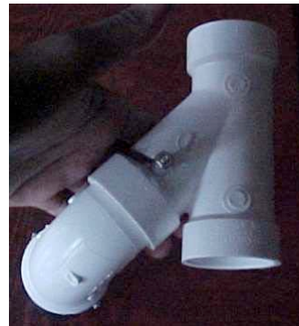
Figure 9. Aerial view of the prototype.