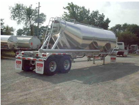
Figure 2. Heil Cementer tanker rear view.

This access point is located nearly 12' above ground and does not have suitable safe access. The tanker discharge pipeline is located at the rear of the truck approximately 4' off the ground, Figure 2. The pipeline is 3" diameter aluminum and mounted on the rear framework of the truck.