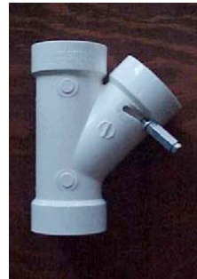
Figure 6. 45° wye pipe section.

The prototype was developed to provide a better visual of the sample shunt. The prototype was designed at a 0.5 scale. PVC was chosen to make the prototype due to the ready availability of materials, sizes, shapes, and ease of construction. A 45° wye pipeline and a 90° pipe section were selected.