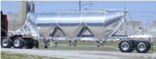
Figure 1. Heil Cementer tanker trailer.

The development process addressed the necessary issues mentioned above. There are two locations on a tanker, which allow access to the material. The three manholes on the top of the tanker and the discharge pipeline on the rear of the vehicle are the only access points to the material inside the tank. The three manholes on the top of the tank are accessible by climbing to the top of the tank, Figure 1.