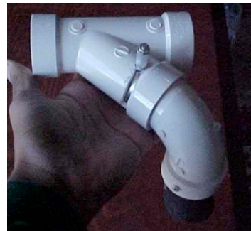
Figure 10. Side view of the prototype.