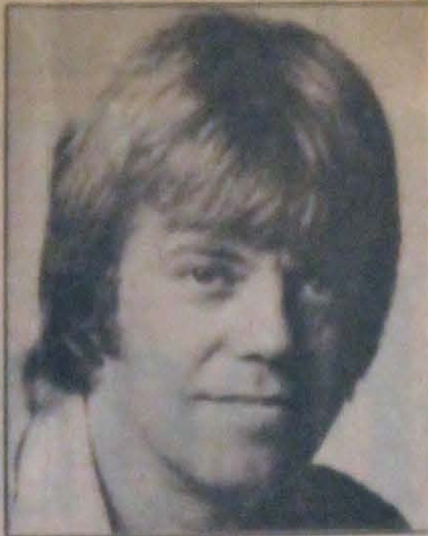
Drummer Butch Miles joins Basie-Ellington show at NYU. Mar. 19-25, 1986

The program, of course, will be representative of the material those alumni performed with their late leaders.