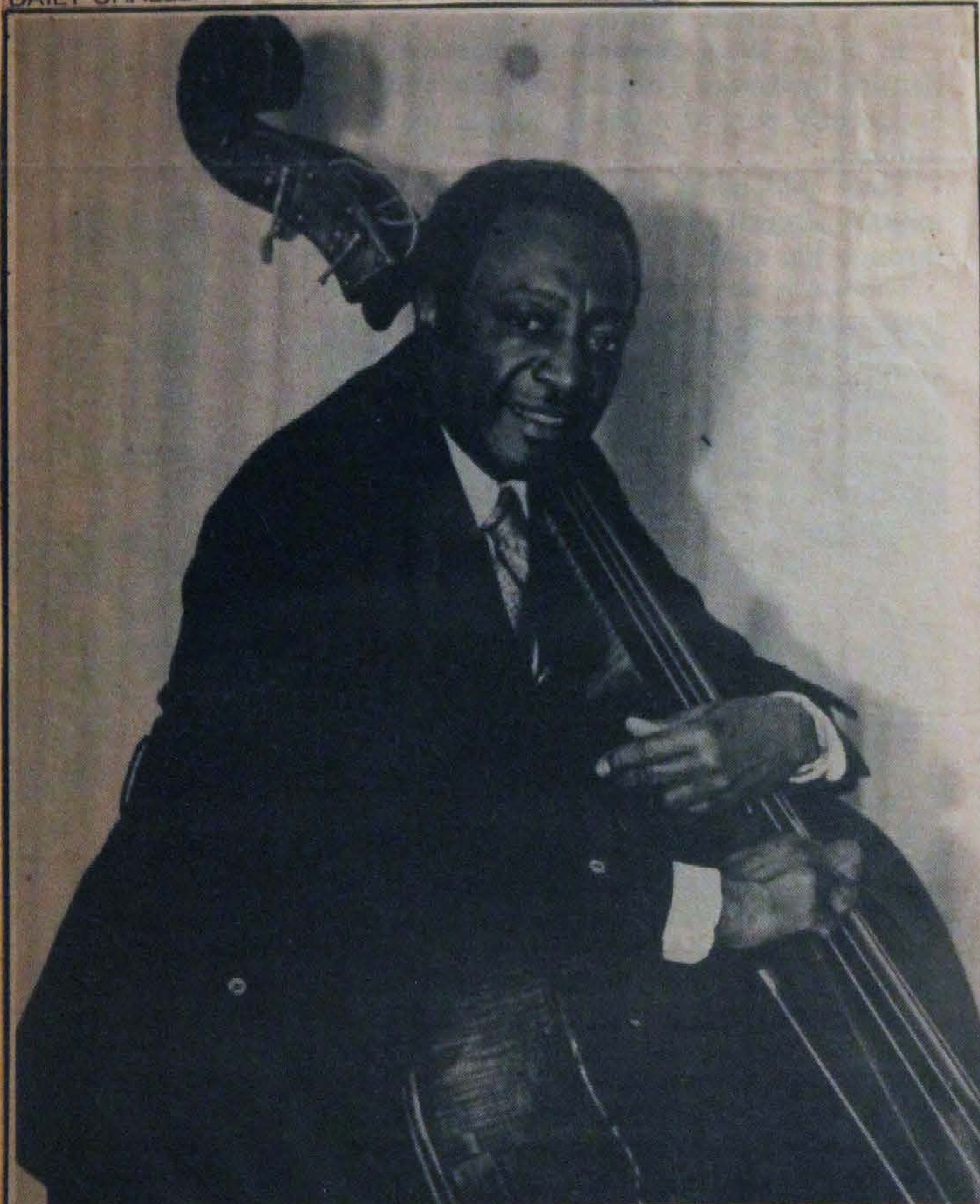
THE HIGHLIGHTS IN JAZZ CONCERT Series resumes tonight at NYU's Loeb Student Center. Playing for this performance is "Still Going Strong" at 8 p.m. All the jazz giants participating in this concert are over 75-years-old and include Art Hodes on piano; Milt Hinton on bass; George Kelly on saxophone; Doc Cheatham on trumpet and vocals; Tommy Benford on drums; and Clarence Hutchenrider on clarinet. Pictured above is Milt Hinton. For further information call (212) 598-2027.

DAILY CHALLENGE THURSDAY, SEPTEMBER 25, 1986