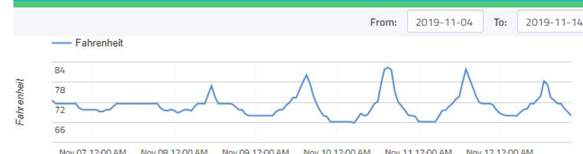
Figure 3: Temperature - Fahrenheit Degrees from Cayenne App