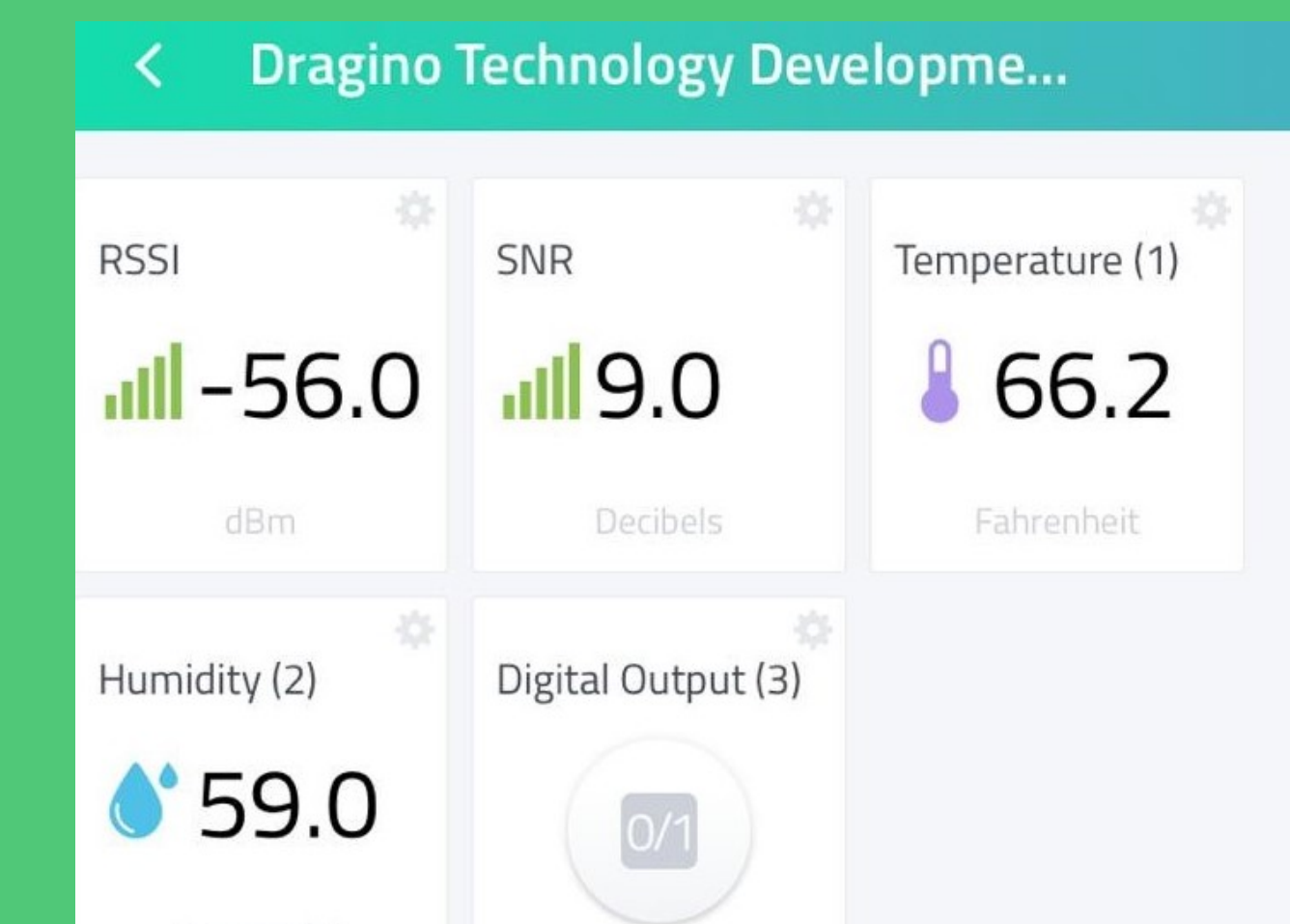
Figure 5: Cayenne Mobile App view

Remotely monitor and control the IoT sensors.