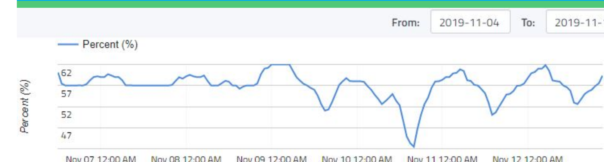
Figure 4: Humidity % from Cayenne App