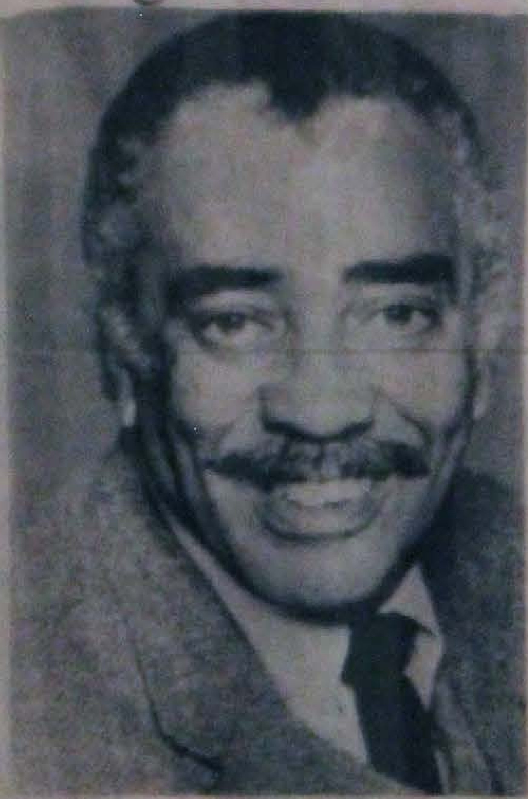
OSCAR BROWN, JR.

There will also be a special "surprise" guest to fill out the program. Tickets are