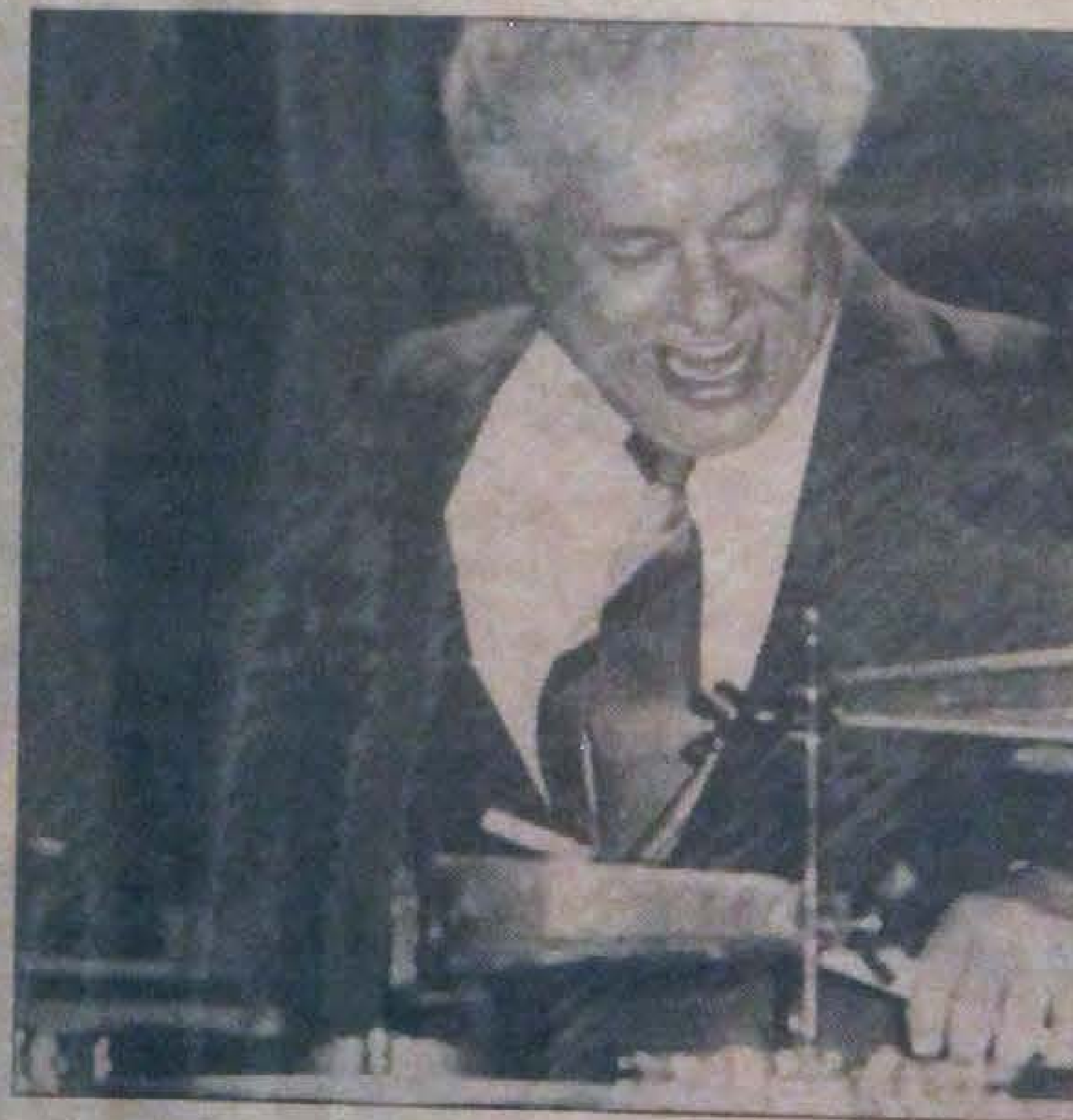
Tito Puente, in concert tonight at NYU