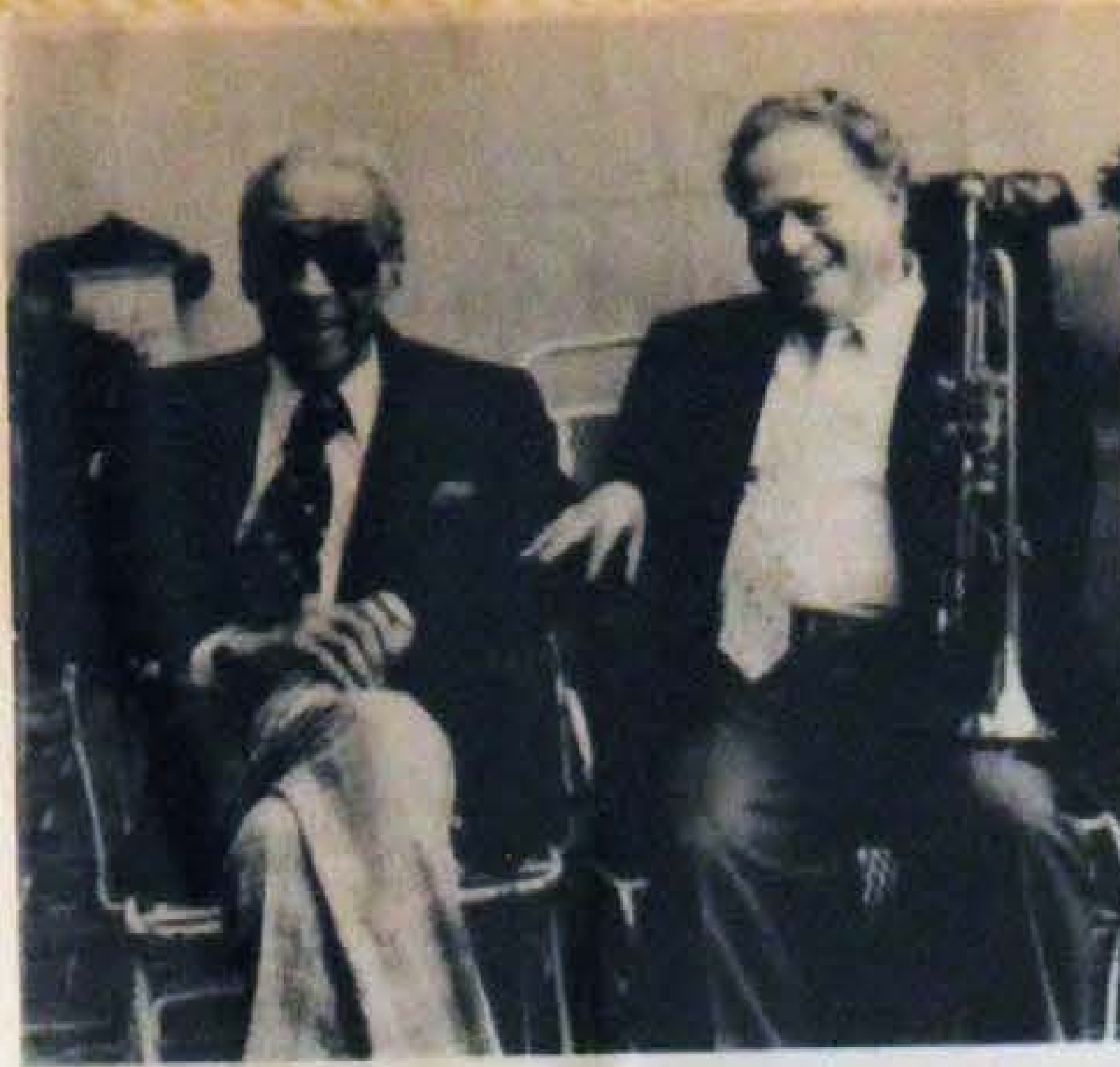
Buck Clayton and Red Rodney