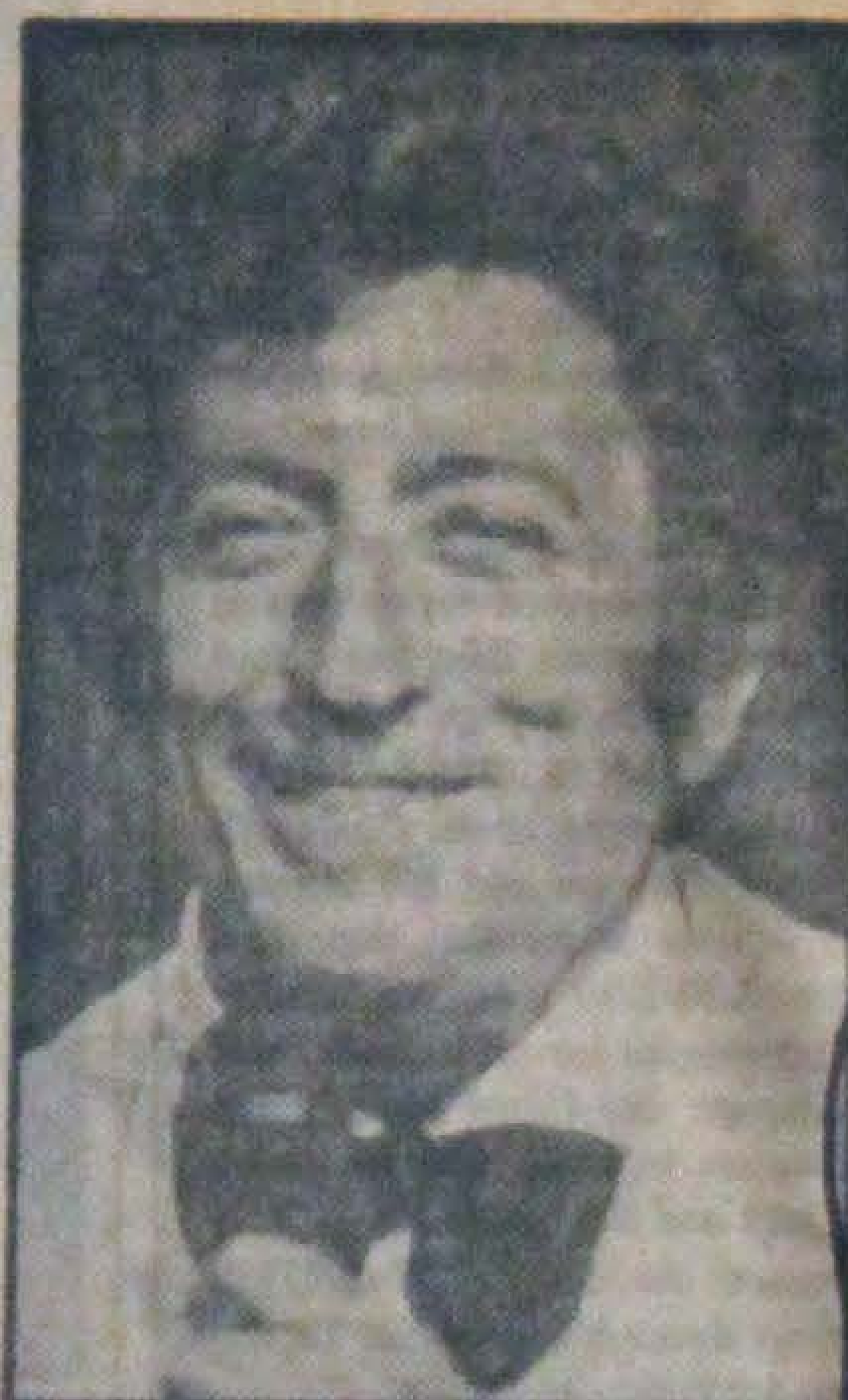
TONY BENNETT Salute to Dorsey.