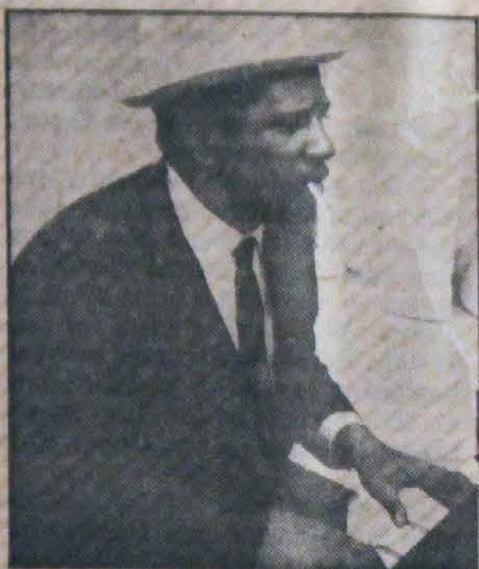
THELONIOUS MONK Behind the veneer.

La Troupe Makandal. The festival's fall calendar also features "The Hendrix Project," jazz musicians including Julius Hemphill and Geri Allen interpreting Jimi Hendrix (Dec. 1), and the reunion