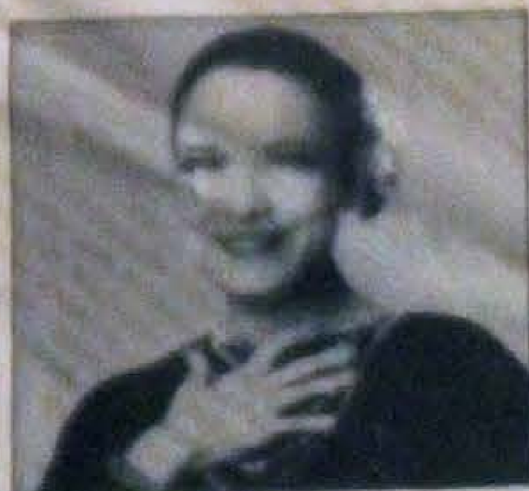
It's Julie Wilson at the Cafe Carlyle.

What a wonderful way to open the New York night life season, with Miss Julie Wilson! Julie, who has performed all over the world, will be in residence at Cafe Carlyle (35 E. 76th St., 744-1600) until Oct. 28th. If you want to see what cabaret is really all about, don't miss Julie; she is merely superb.