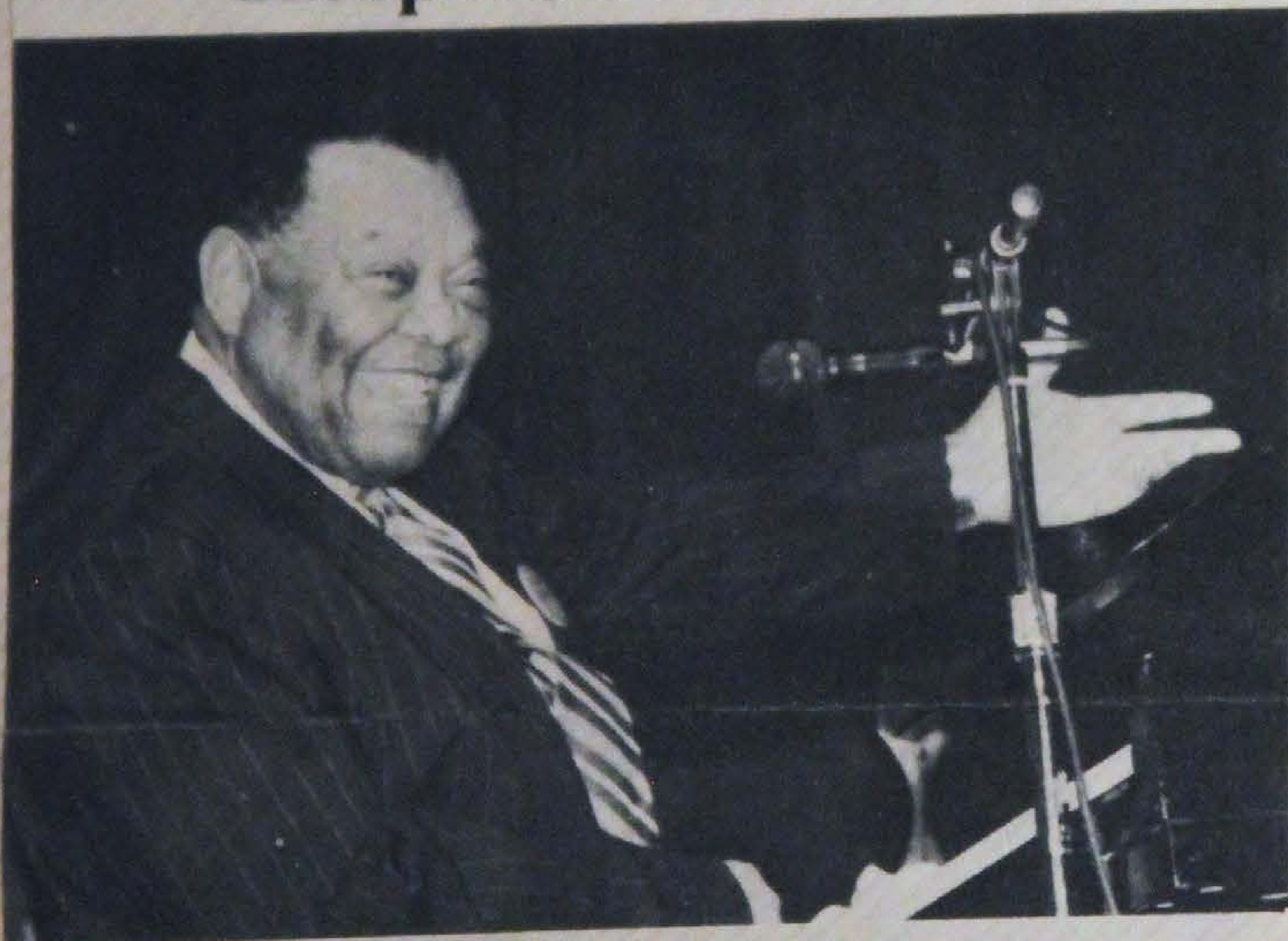
Jay McShane is a pianist/composer/singer

Highlights in Jazz , New York's longest running series jazz will present Kansas City jazz legend Jay McShann , Doc Cheatham , Kenny Davern , Frank Tate , and Jack Williams in a concert headed up Keepers of the Flame on Thursday, January 10th, 1991 at 8 pm at the Pace Downtown Theater, 3 Spruce Street (between Park Row and Gold Street).