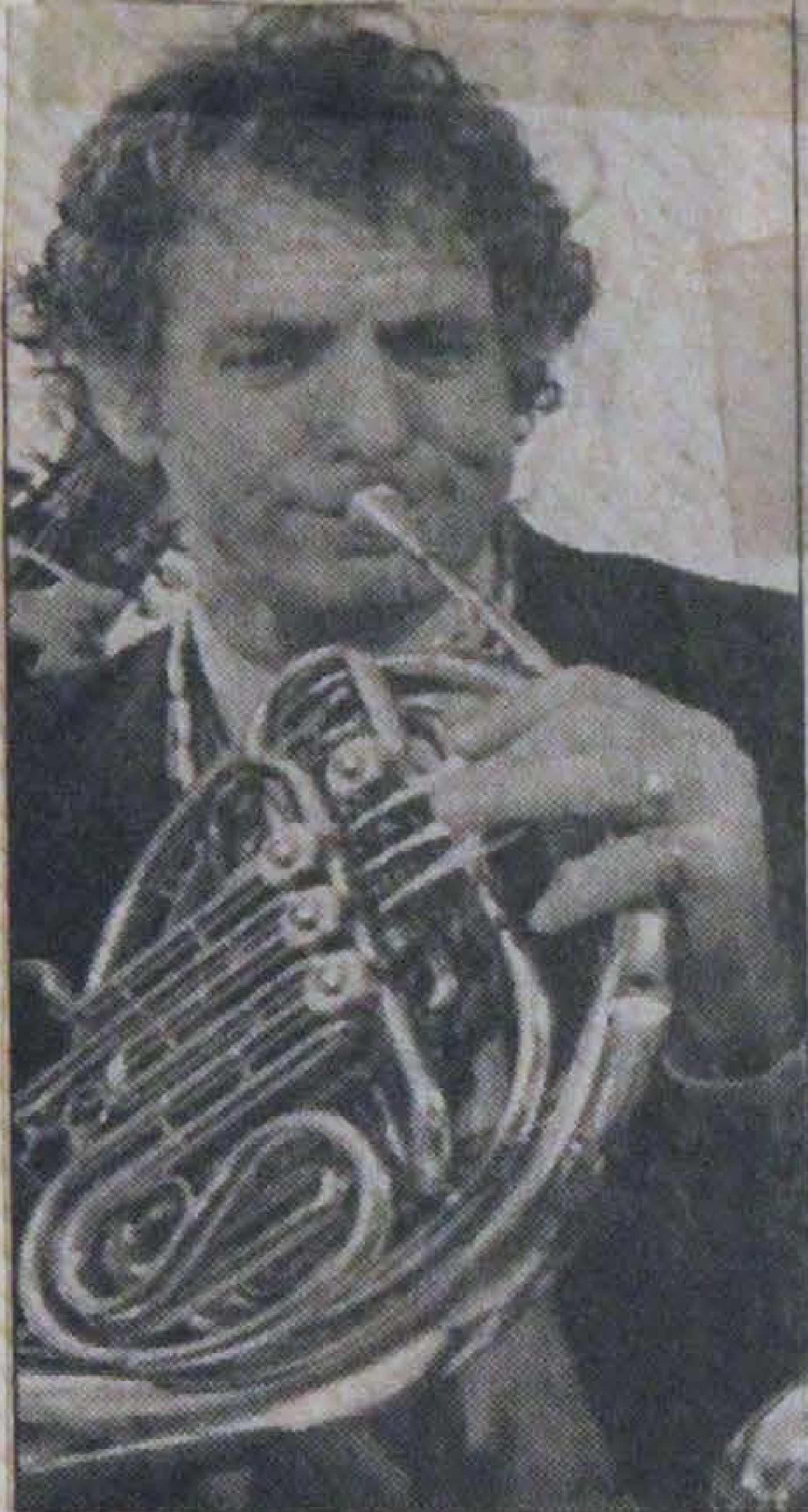
David Amram and his quartet will play on Sunday at Fortune Garden Pavilion.

David Amram Quartet, Freddy Cole Trio, Fortune Garden Pavilion, 209 East 49th Street, Manhattan, (212) 753-0101. Although the French hornist David Amram was prominent in the jazz world in the 1950's and 60's, playing with Charles Mingus and