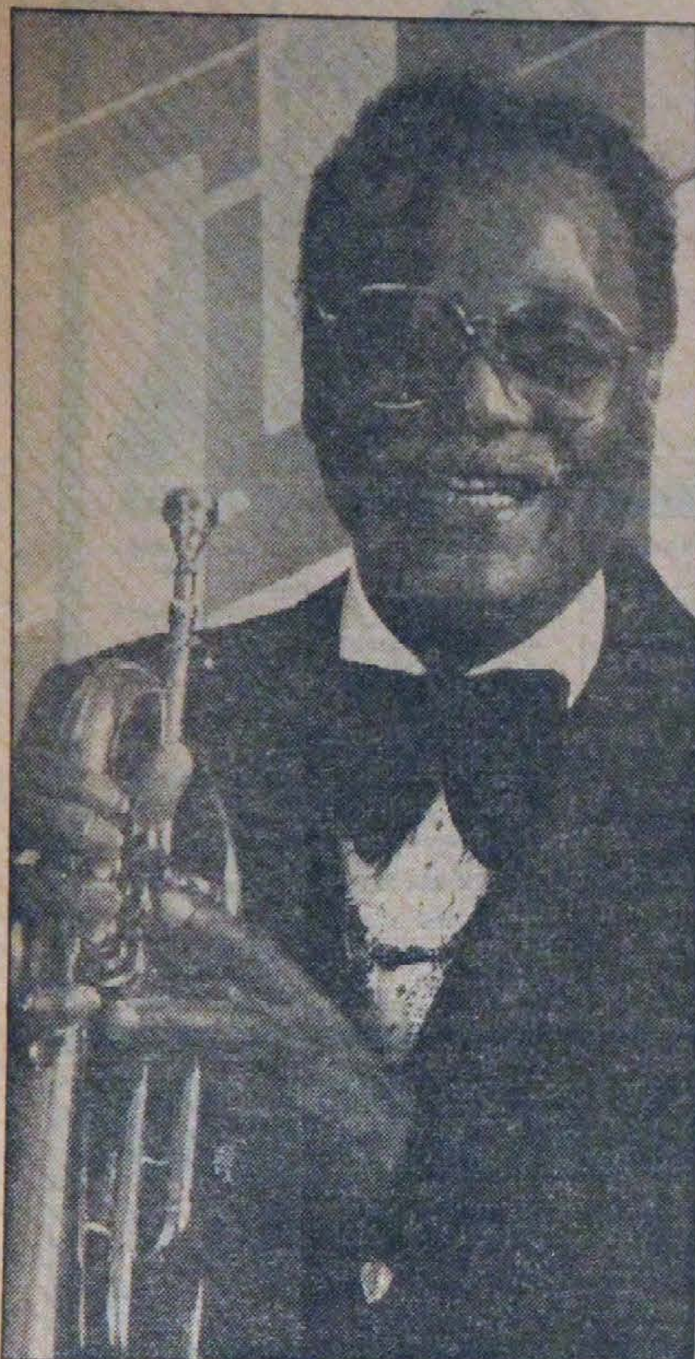
TERRY TUNES: Clark Terry will handle the trumpet.