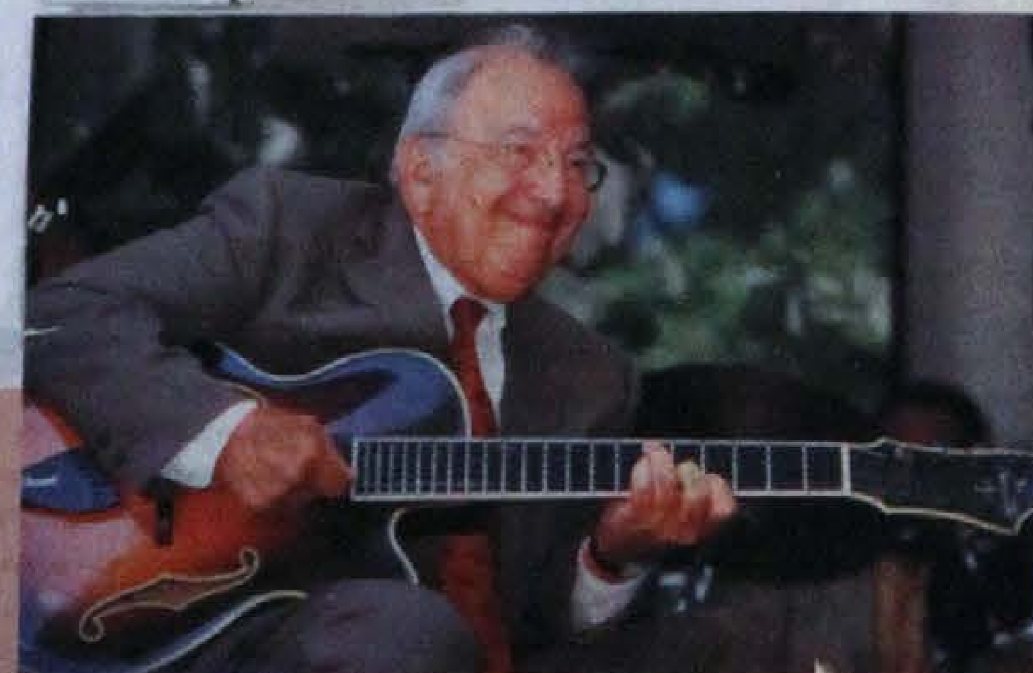
RATTLE AND STRUM: Bucky Pizzarelli swings at Birdland.

★ "Highlights in Jazz" Presents: The Pizzarelli Family With John Pizzarelli; Bucky Pizzarelli; Jessica Molaskey.