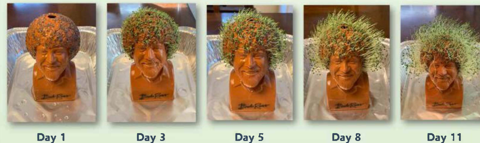
Figure 3: Images of the Chia pet over several days of growth