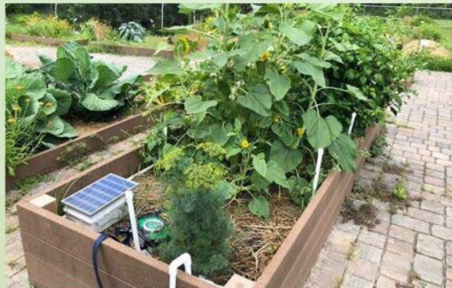
Figure 1: Automated Gardening at the University of North Florida

The main objective is to record and analyze the growth of vegetation through image processing