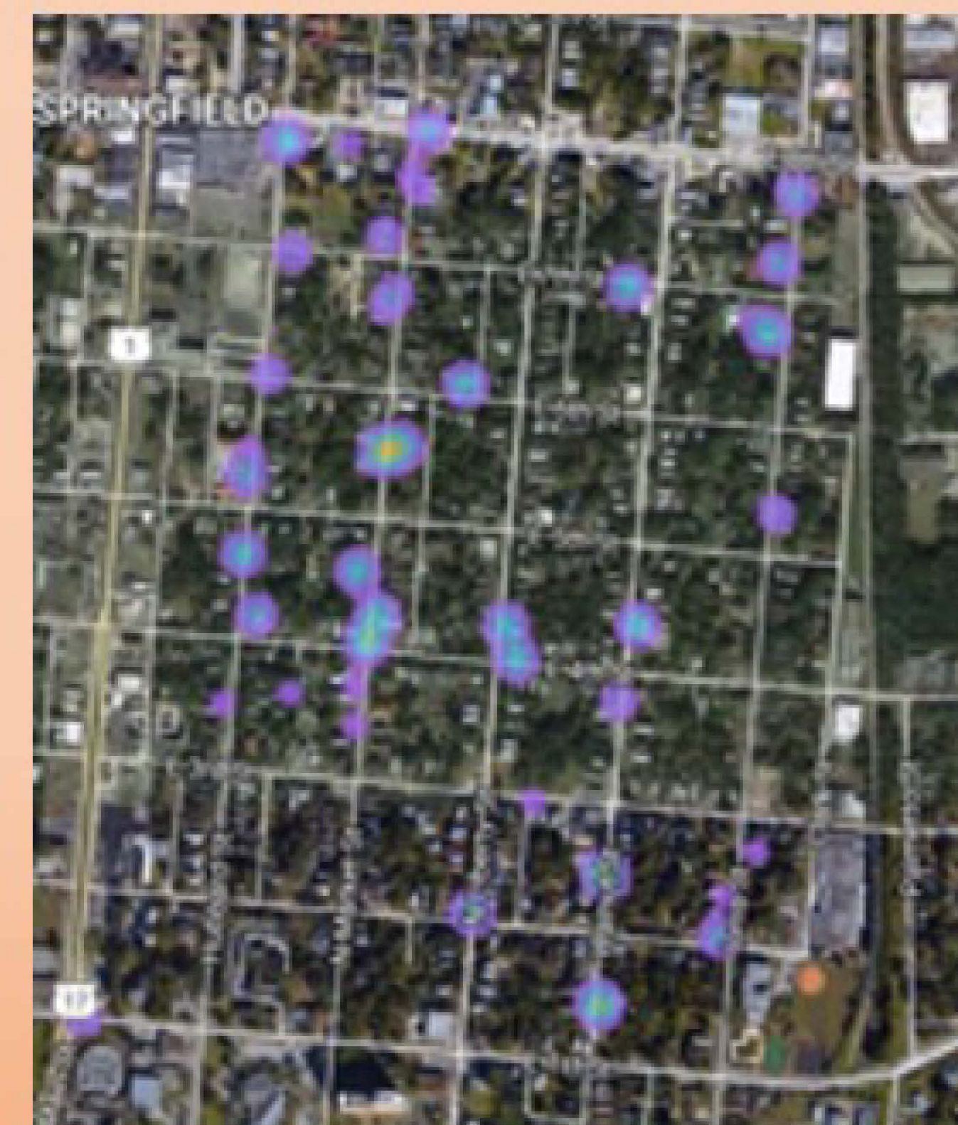
Quadrant 1 of Springfield mapped by Google Geo-Location feature in Google Photos. Shows which streets have a higher density of sidewalk damage.