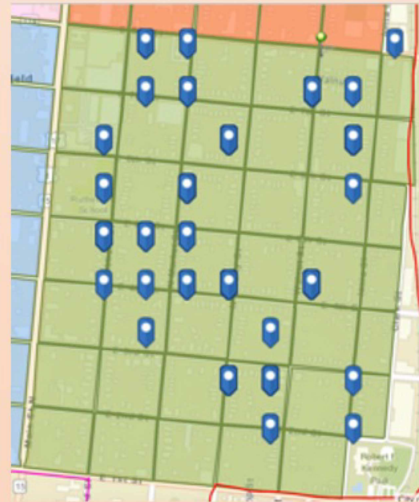
Mapped out pin points with pictures of each type of broken sidewalk.

Though the project is not yet complete, an entire quadrant of the neighborhood has been notated on a map utilizing Geographic Information Systems (GIS) to more easily and accurately depict the areas that need attention from local officials to address the need for redevelopment.