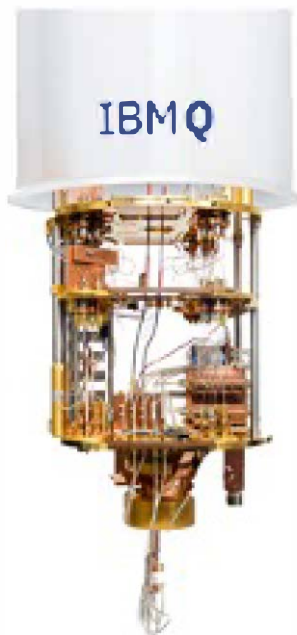
Figure 1: IBM's 50 qubit quantum computer

If N is large enough, it is nearly impossible to recover p and q , making RSA practically impossible to hack. This assumption fails however when quantum computing, in particular Shor's algorithm, is introduced. Fig. 1 is one of today's quantum computers.