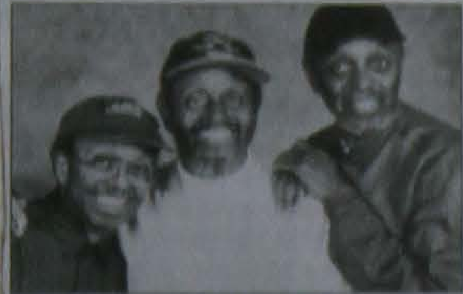
The fabulous Heath Brothers: Jimmy, saxophone; Percy, bass; Albert "Tootie", drums