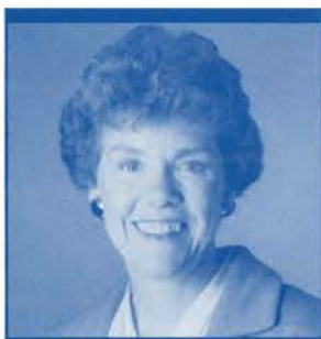
JOSIE HEATH, CANDIDATE FOR U.S. SENATE, COLORADO