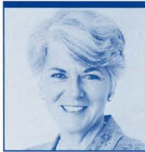
GERALDINE FERRARO, CANDIDATE FOR U.S. SENATE, NEW YORK