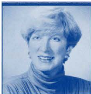
LYNN YEAKEL, CANDIDATE FOR U.S. SENATE, PENNSYLVANIA