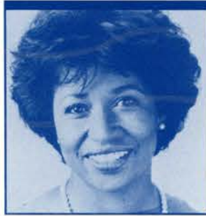
CAROL MOSELEY BRAUN, CANDIDATE FOR U.S. SENATE, ILLINOIS