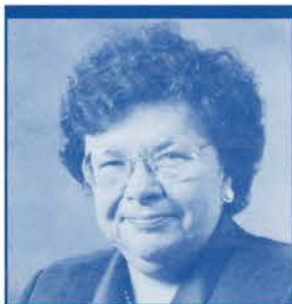
BARBARA MIKULSKI, CANDIDATE FOR U.S. SENATE, MARYLAND