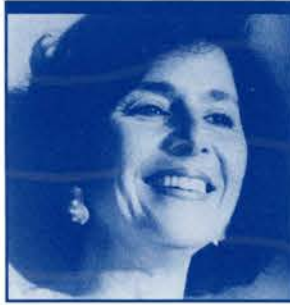
BARBARA BOXER, CANDIDATE FOR U.S. SENATE, CALIFORNIA