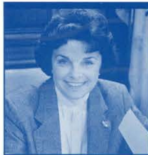
DIANNE FEINSTEIN, CANDIDATE FOR U.S. SENATE, CALIFORNIA